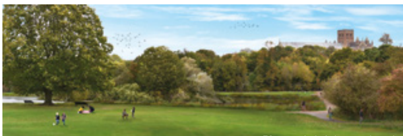
Picture: Artist's impression of what the project will deliver.

The Council agreed in a unanimous vote in July last year to declare a climate emergency. An update on the past year's progress was given to September's virtual meeting of the Full Council.