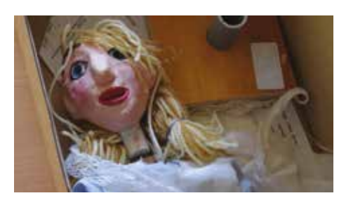
International Organ Festival Mon 10 - Sat 22 July

Featuring free events across the City centre. There's folk, country, blues, pop and rock, and lots of opportunities to join in! The Festival culminates in the IOFringe Garden Party and a special musical 'Heroes' celebration! www.facebook. com/iofringe, www.lemonrock.com/ iofringe.