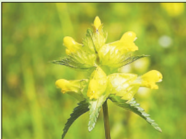
Yellow rattle, a vampire at heart

Finally, store bins out of direct sunlight, don't fill them to overflowing and make sure you keep lids tightly closed.