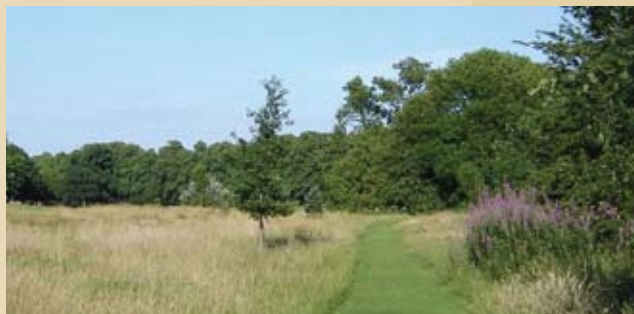
Summer meadow area.

For the children, a well equipped enclosed playground provides plenty of challenge for younger children and the very successful skate park provides a more challenging element of play. Throughout the year there are a number of events such as the Harpenden Carnival and the Highland Games.