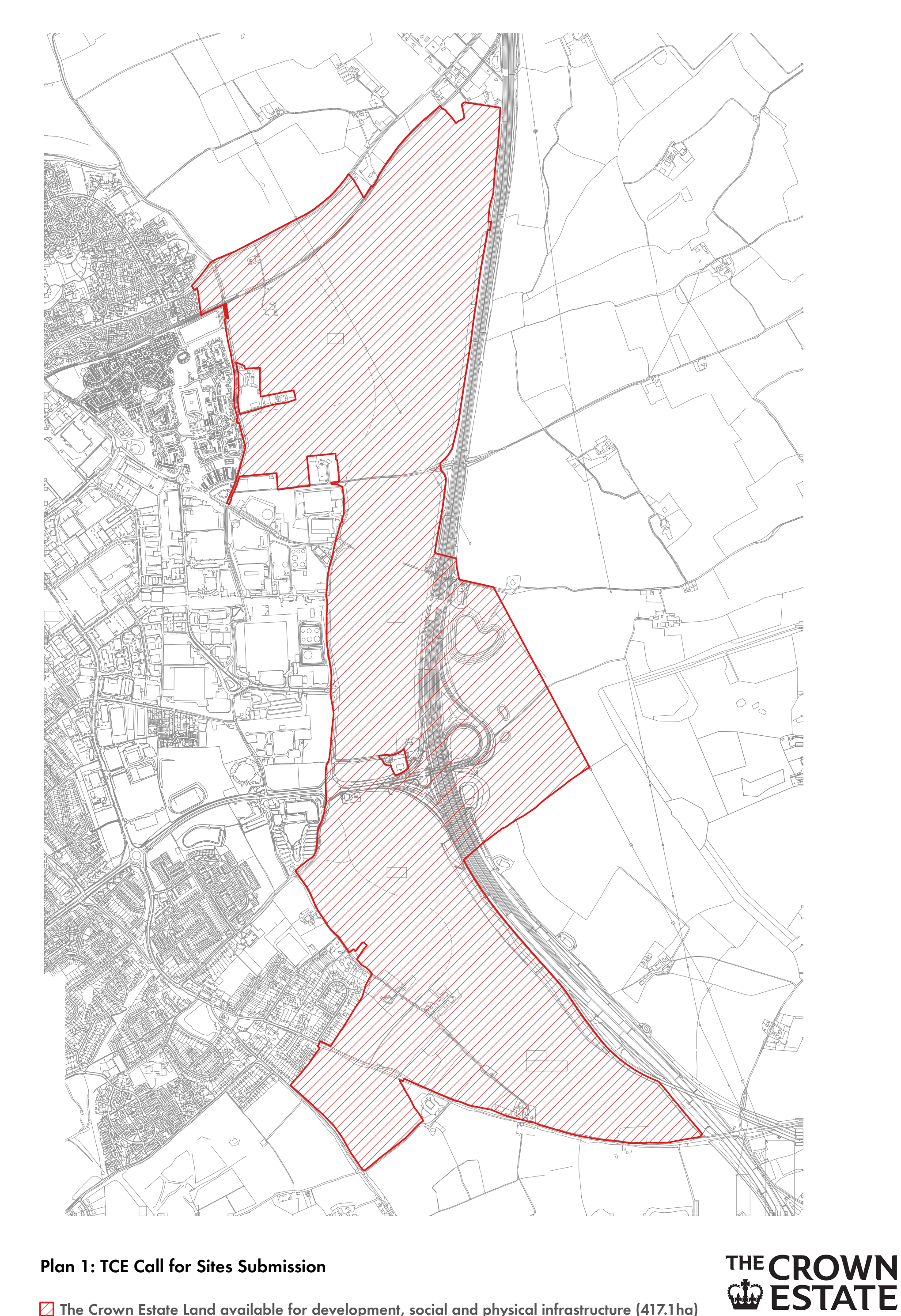
Plan 1: TCE Call for Sites Submission

The Crown Estate Land available for development, social and physical infrastructure (417.1ha)