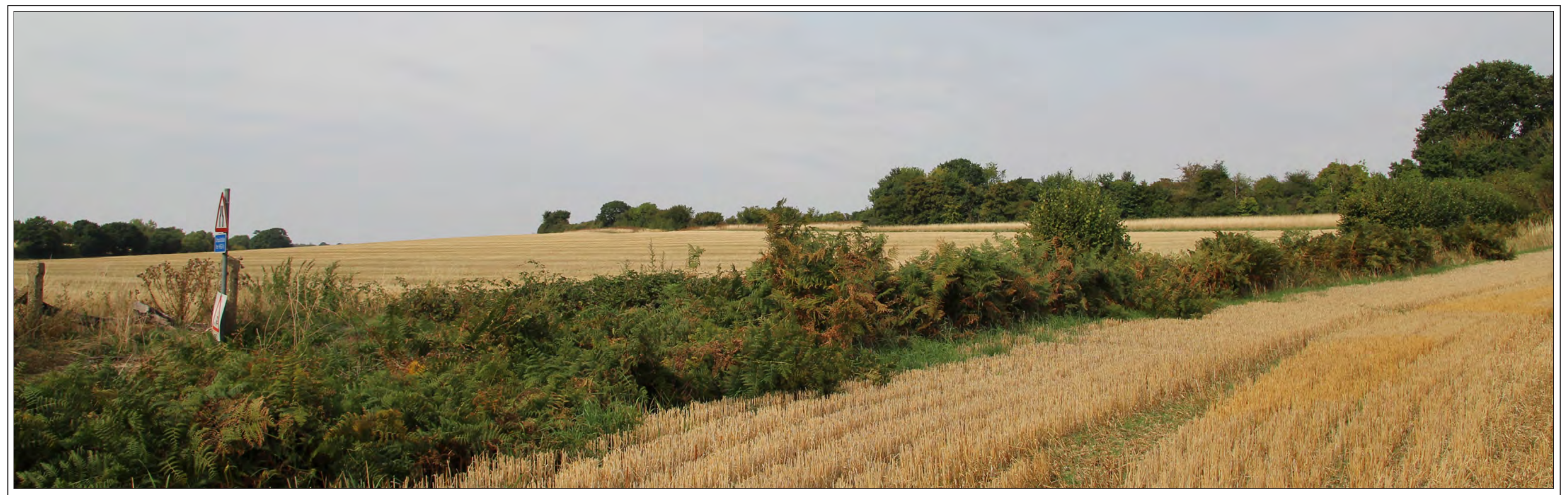
Photograph 9 - H-595 Land at North West Harpenden: At junction between Cooters End Lane and Luton Road (A1081), looking north