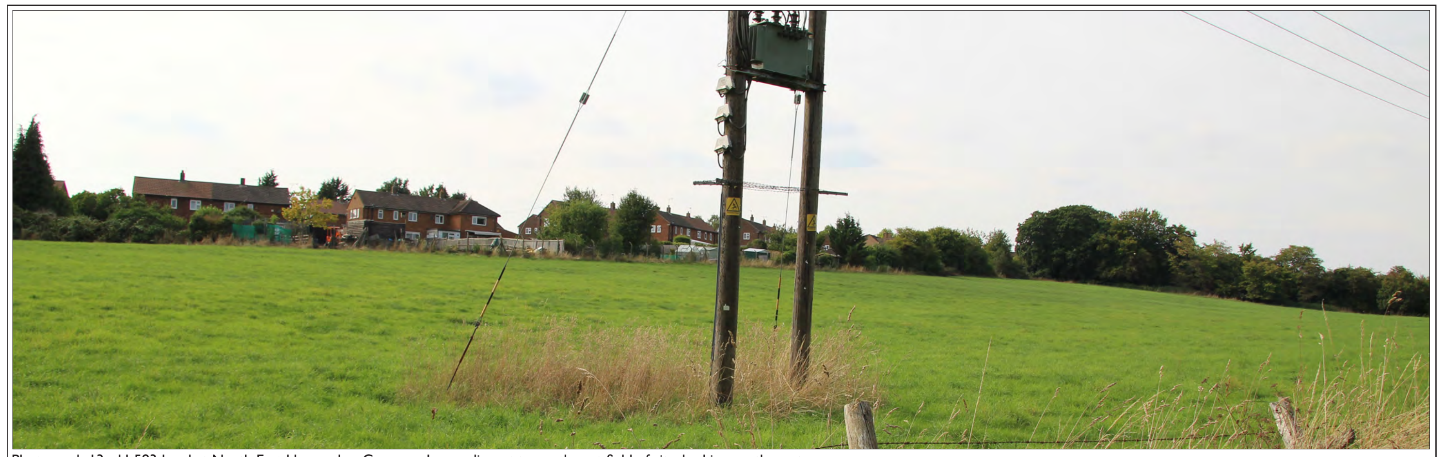
Photograph 13 - H-583 Land at North East Harpenden: Common Lane, adjacent to south-east field of site, looking north-west