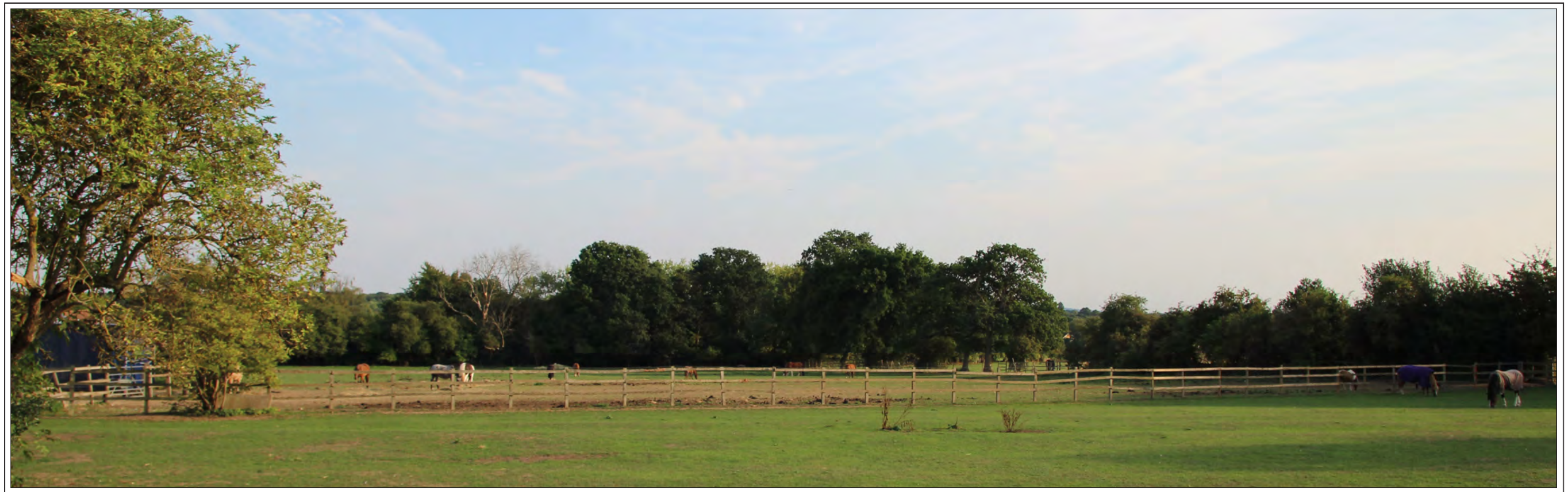
Photograph 23 - CG-561 Land at Chiswell Green: Chiswell Green Lane, looking south