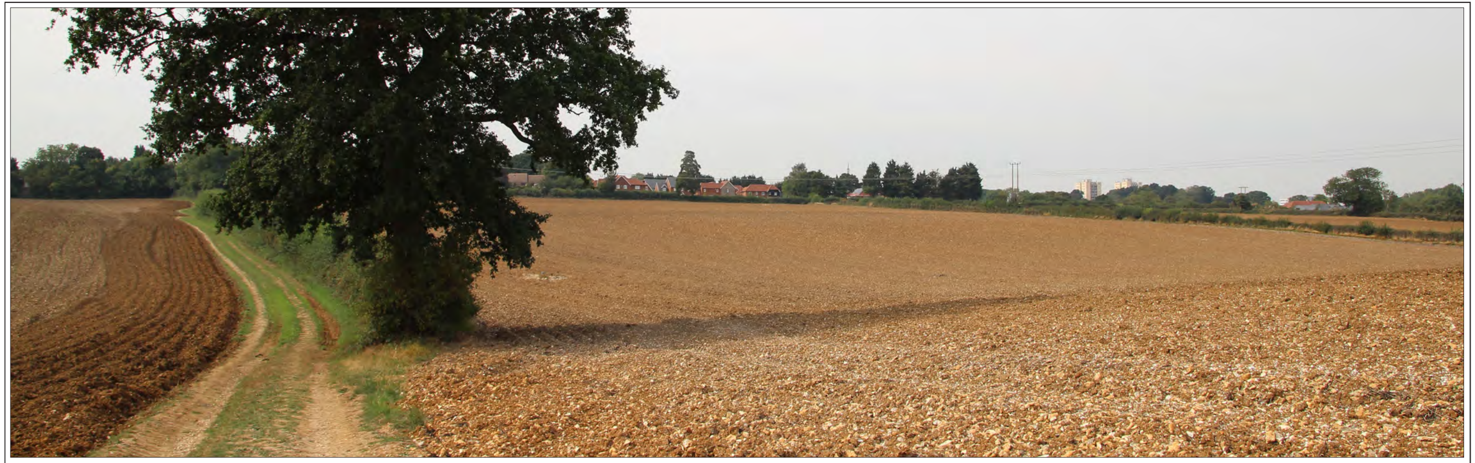
Photograph I - OS-400c East Hemel Hempstead (South): Public right of way within site, looking west