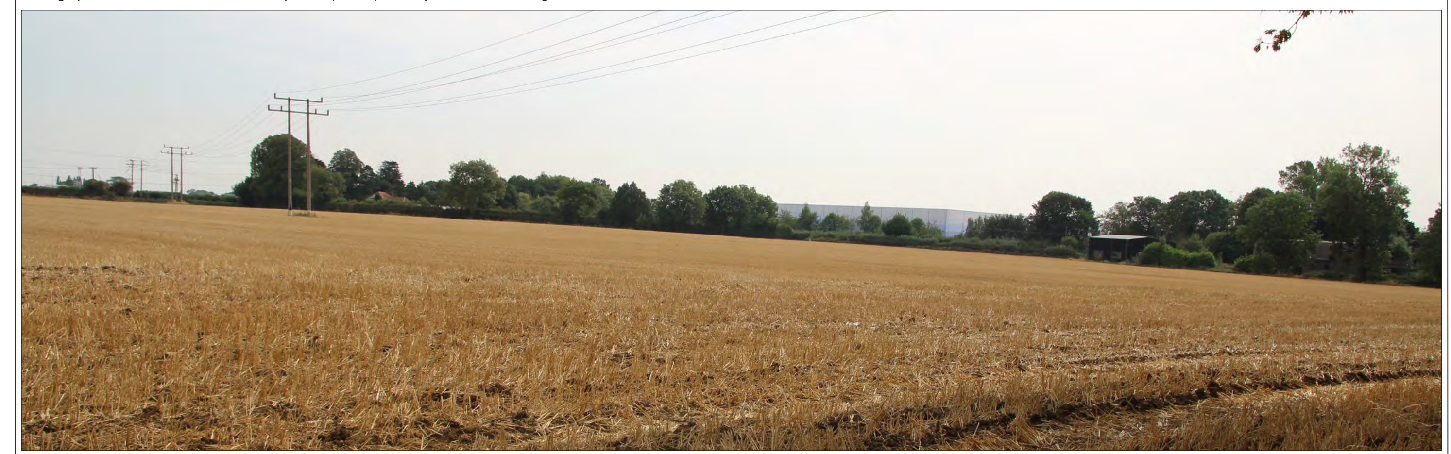
Photograph 6 - OS-400a East Hemel Hempstead (North): Cherry Tree Lane, looking south-east