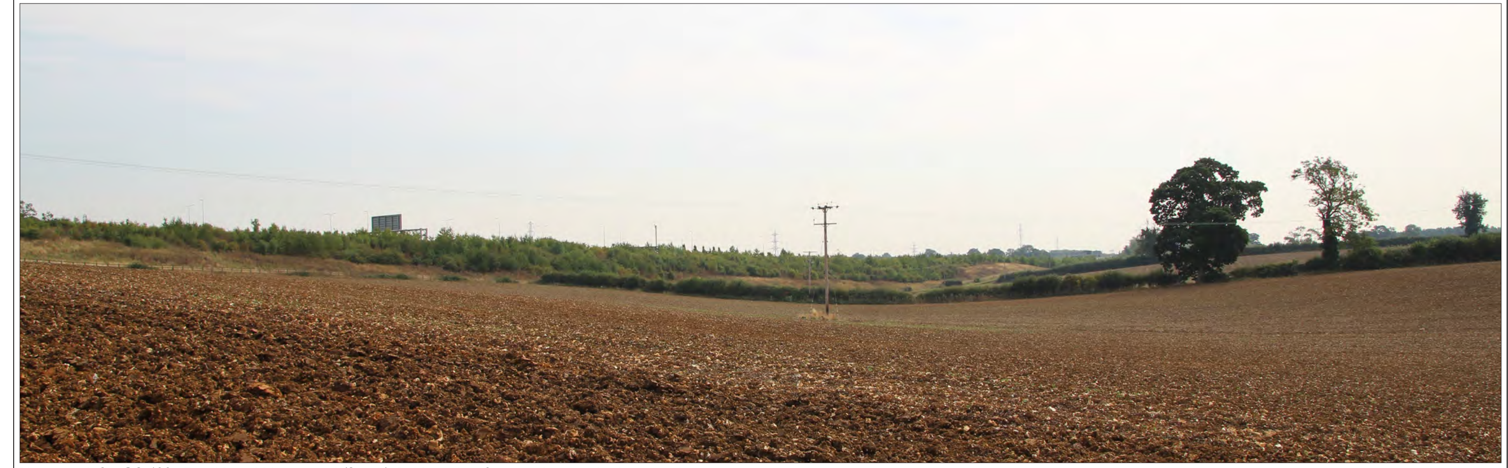
Photograph 2 - OS-400c East Hemel Hempstead (South): Public right of way within site, looking north-east