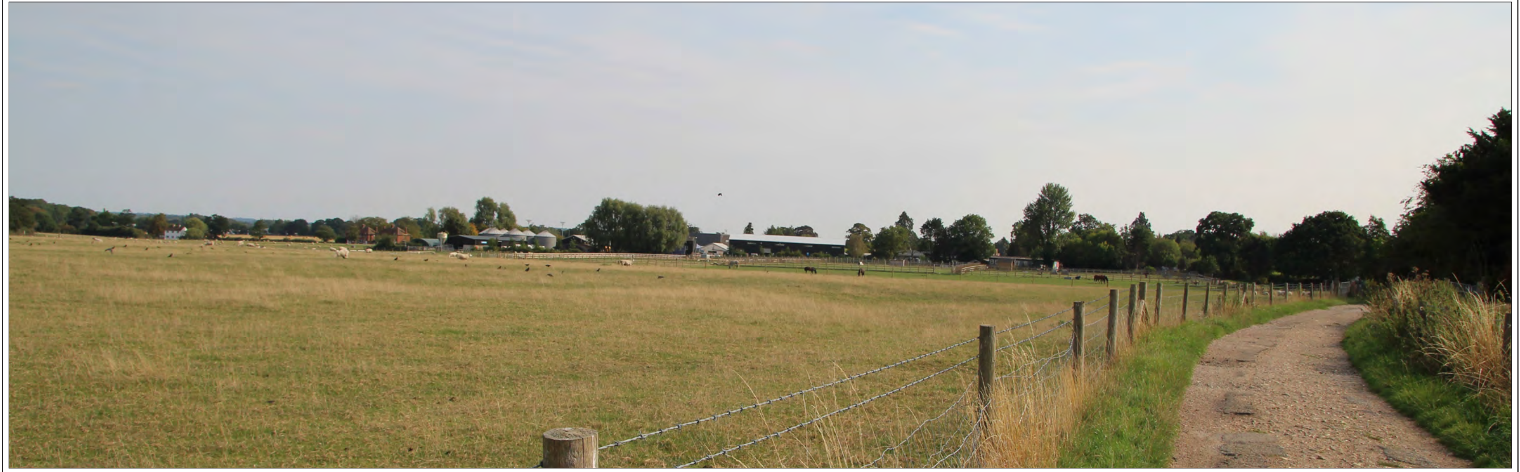
Photograph 18 - SM-626 Oaklands College, Smallford (East St Albans): Public right of way along North Drive within site, looking south-east

NICHOLAS PEARSON ASSOCIATES ENVIRONMENTAL PLANNERS + LANDSCAPE ARCHITECTS + ECOLOGISTS