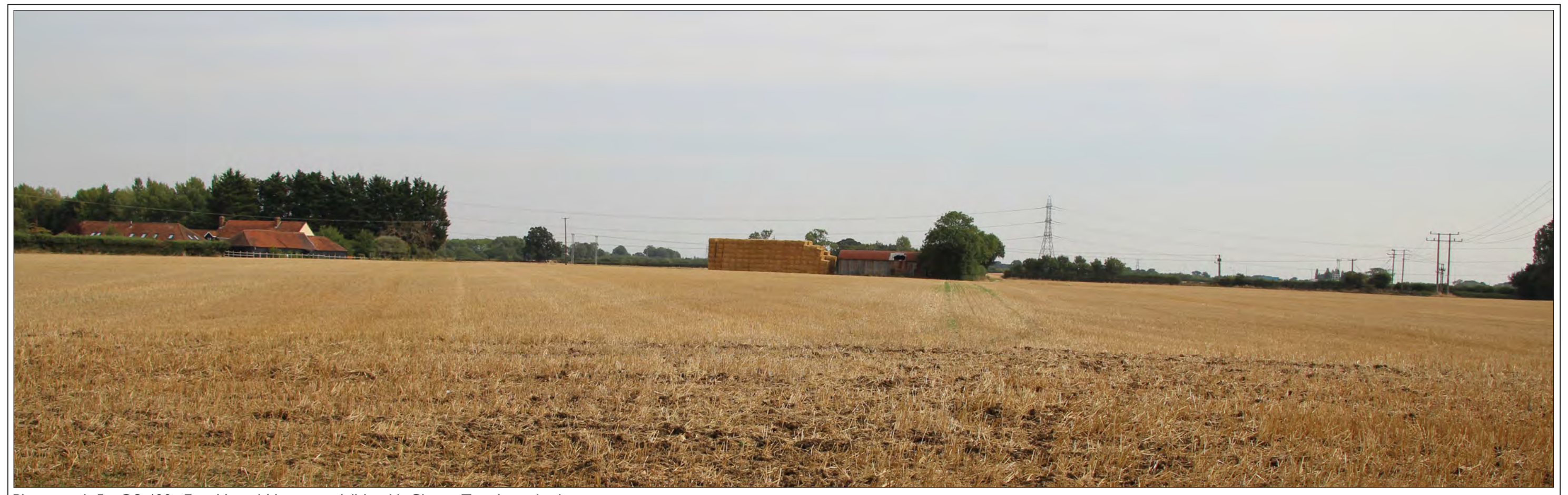
Photograph 5 - OS-400a East Hemel Hempstead (North): Cherry Tree Lane, looking east