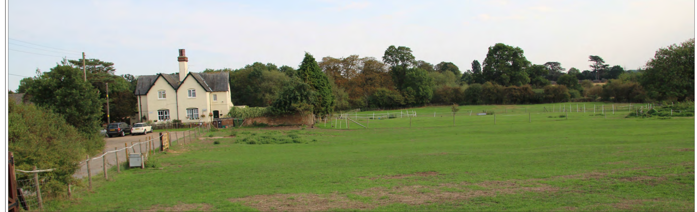
Photograph 22 - Land West of London Colney: Public right of way within eastern part of site, looking south-east