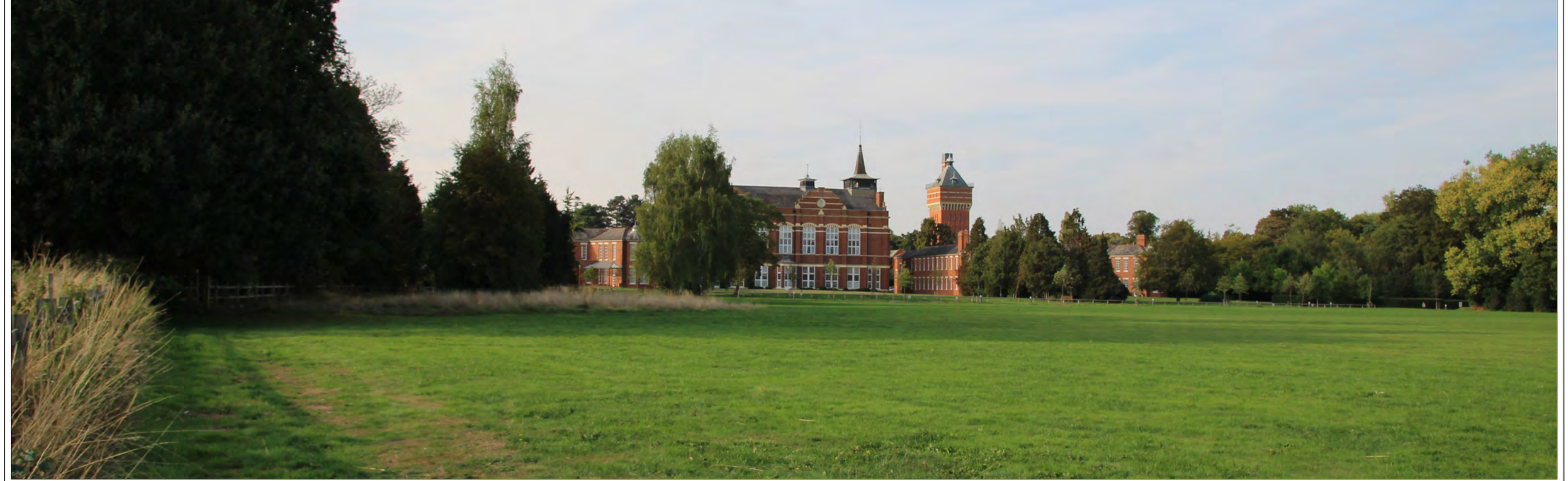
Photograph 20 - Land West of London Colney: Northern boundary of site looking north towards Napsbury Park