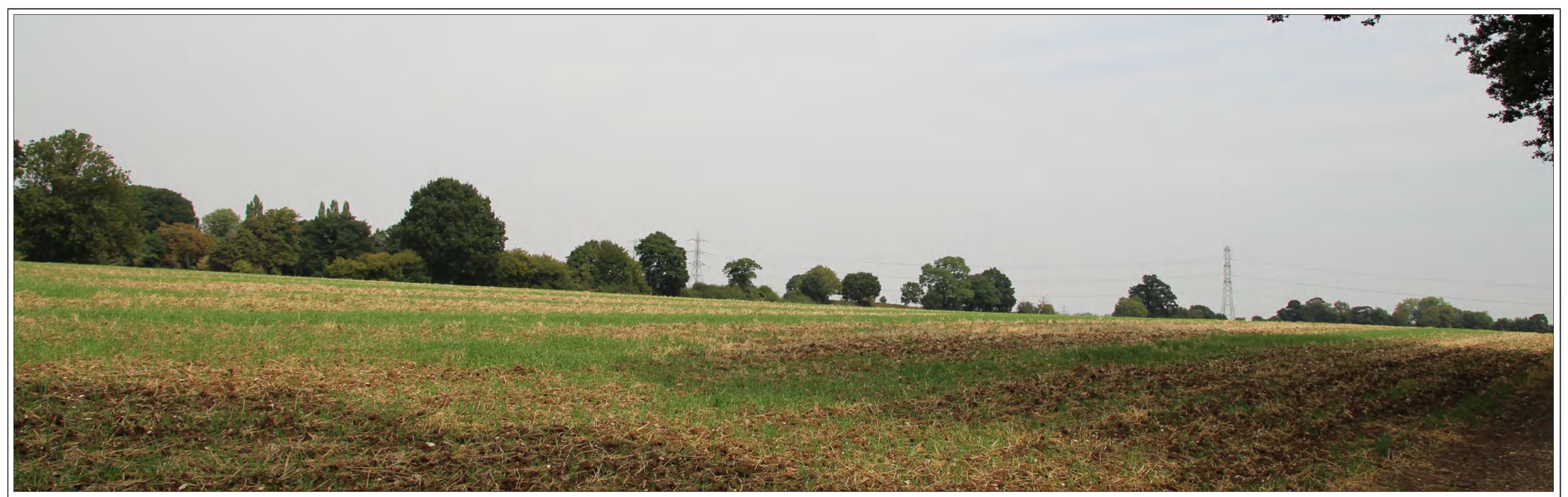
Photograph 7 - OS-602 North Hemel Hempstead: At junction between Holtsmere End Lane and public right of way through site, looking north-east