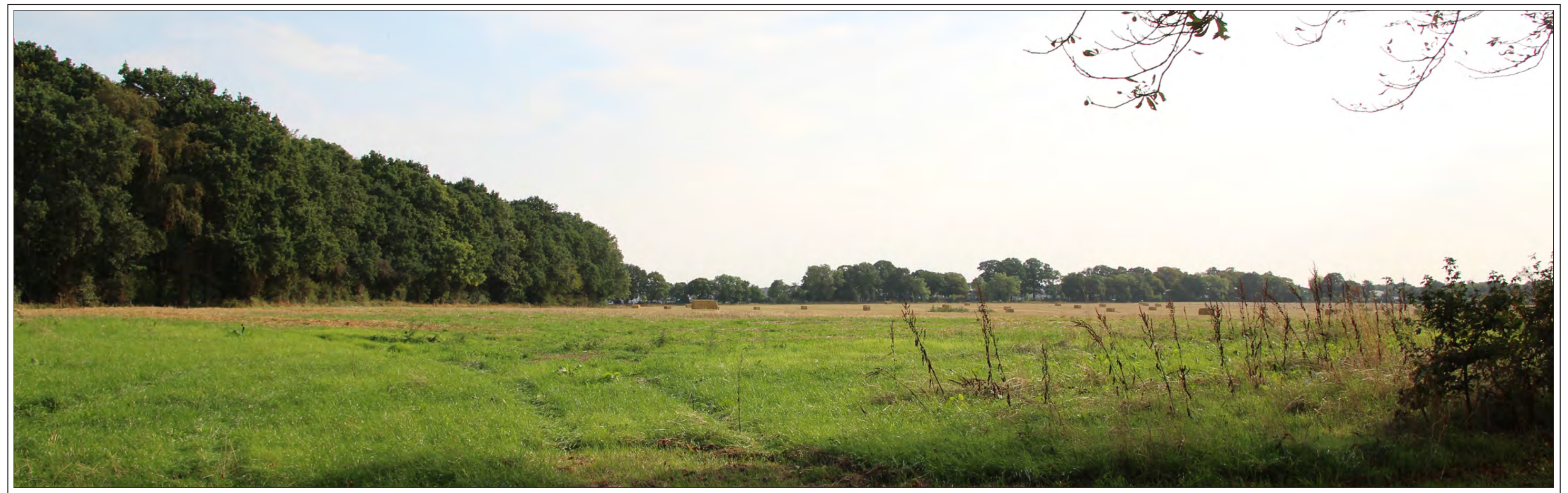
Photograph 19 - SM-626 Oaklands College, Smallford (East St Albans): Public right of way along East Drive within site, looking south