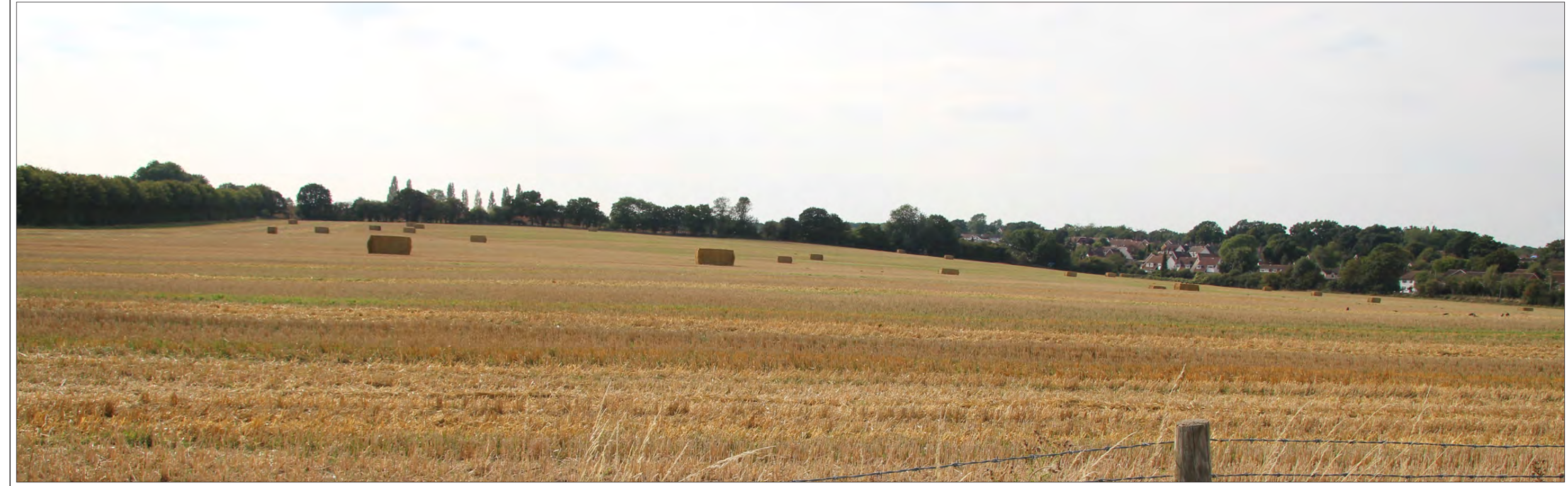
Photograph 16 - SM-626 Oaklands College, Smallford (East St Albans): Public right of way along North Drive within site, looking north-west

NICHOLAS PEARSON ASSOCIATES ENVIRONMENTAL PLANNERS - LANDSCAPE ARCHITECTS - ECOLOGISTS