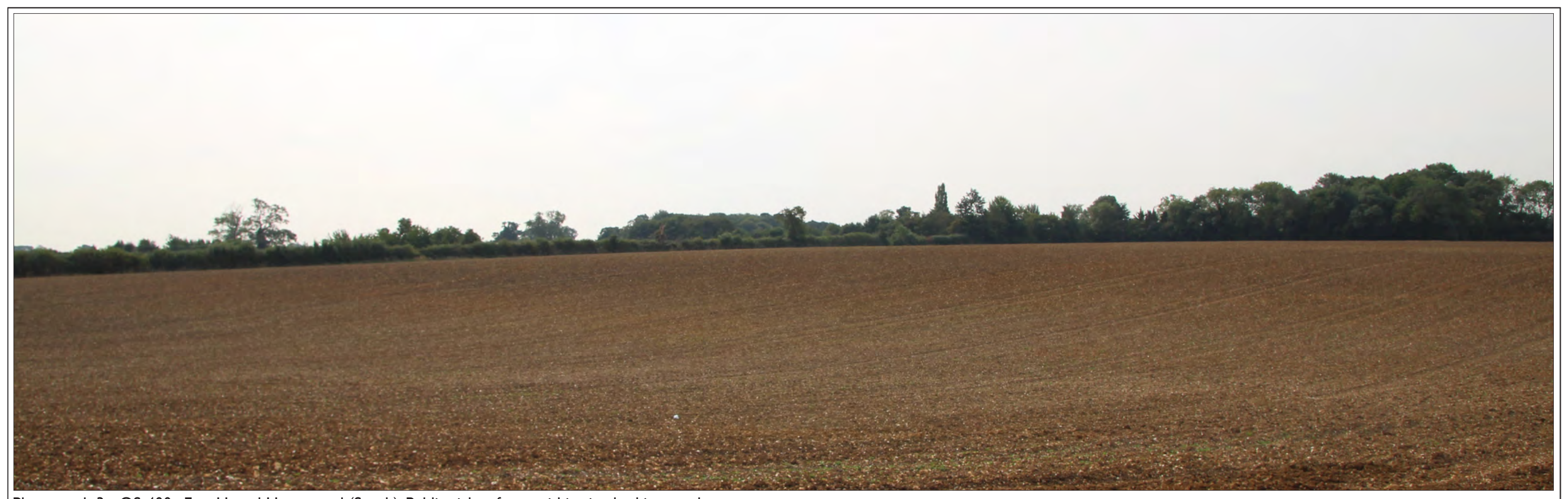
Photograph 3 - OS-400c East Hemel Hempstead (South): Public right of way within site, looking south-east