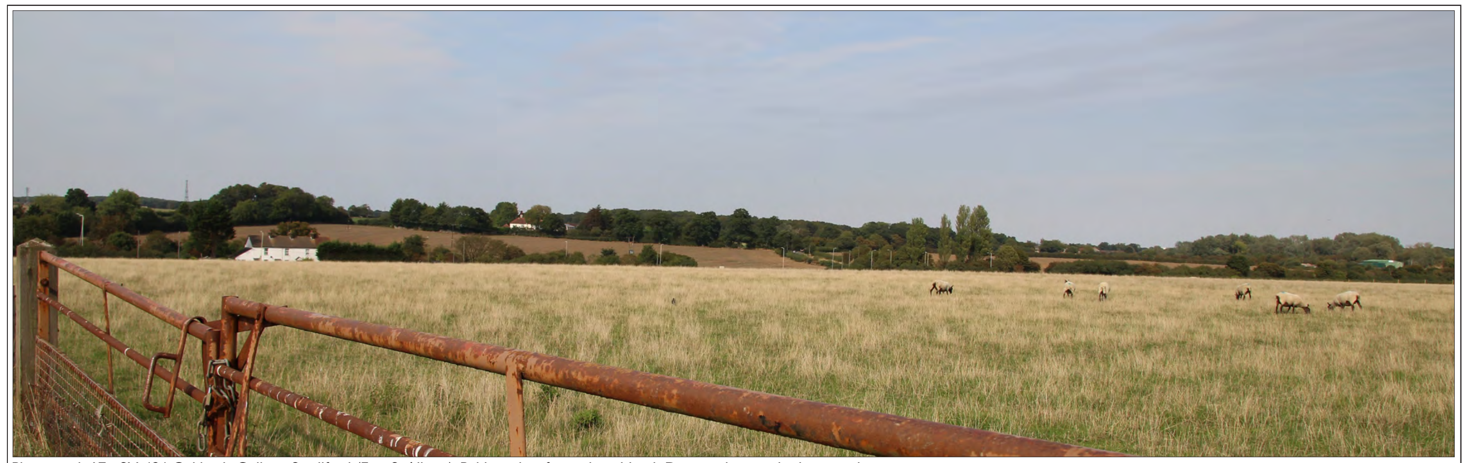
Photograph 17 - SM-626 Oaklands College, Smallford (East St Albans): Public right of way along North Drive within site, looking north-east