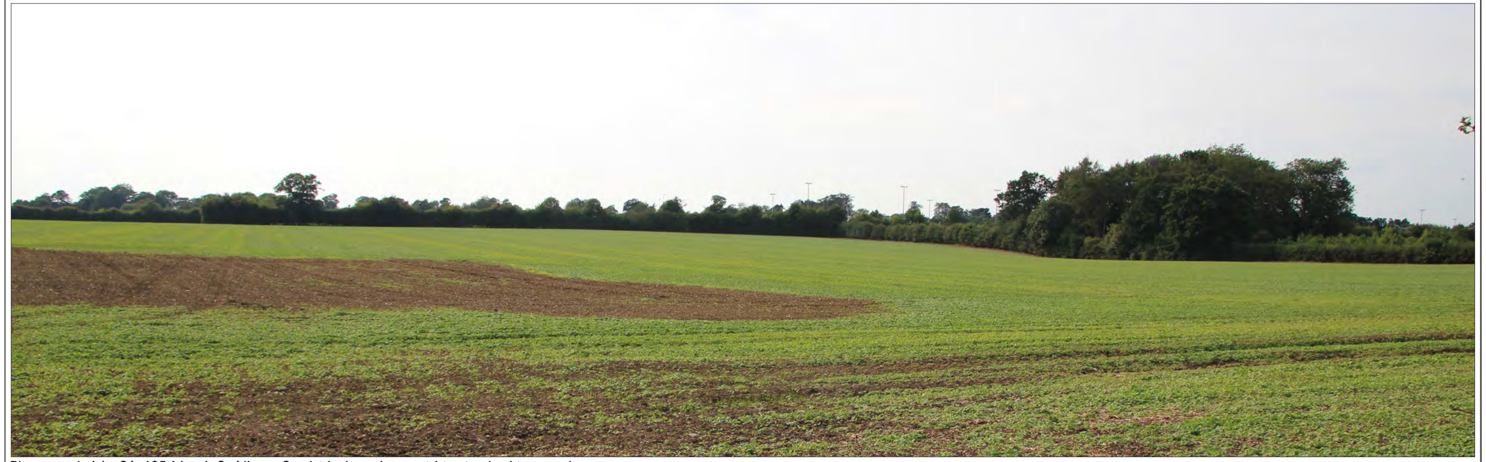
Photograph 14 - SA-605 North St Albans: Sandridgebury Lane within site, looking north-west

NICHOLAS PEARSON ASSOCIATES ENVIRONMENTAL PLANNERS - LANDSCAPE ARCHITECTS - ECOLOGISTS