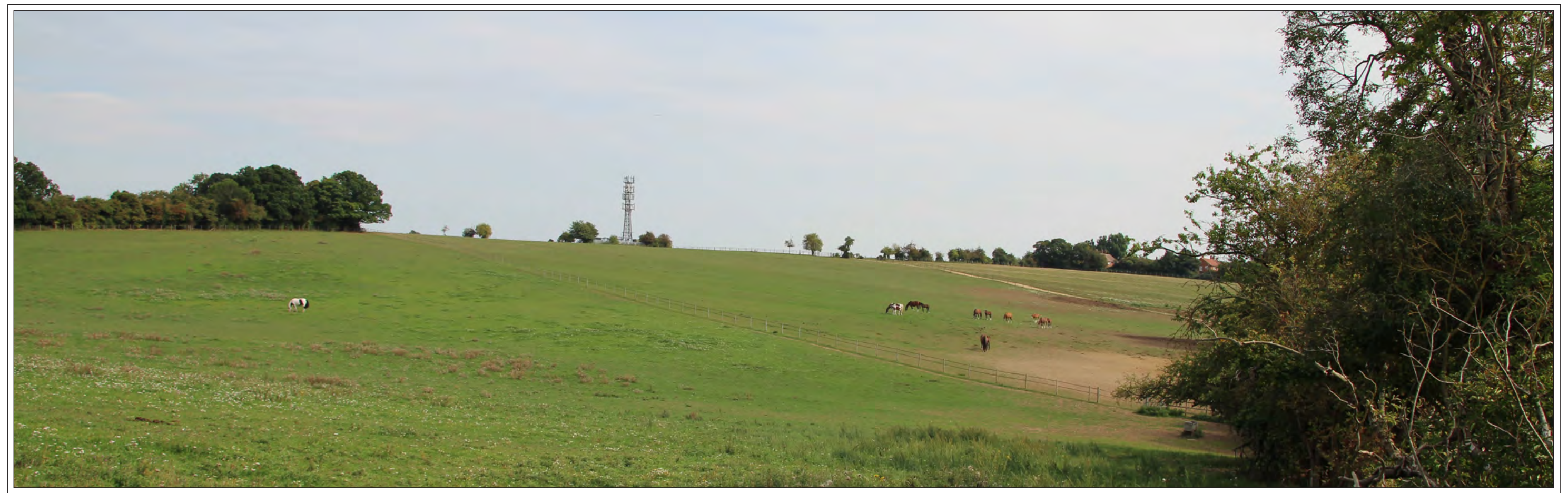
Photograph II - H-583 Land at North East Harpenden: Bower Heath Lane, at junction to public right of way through site, looking south-east