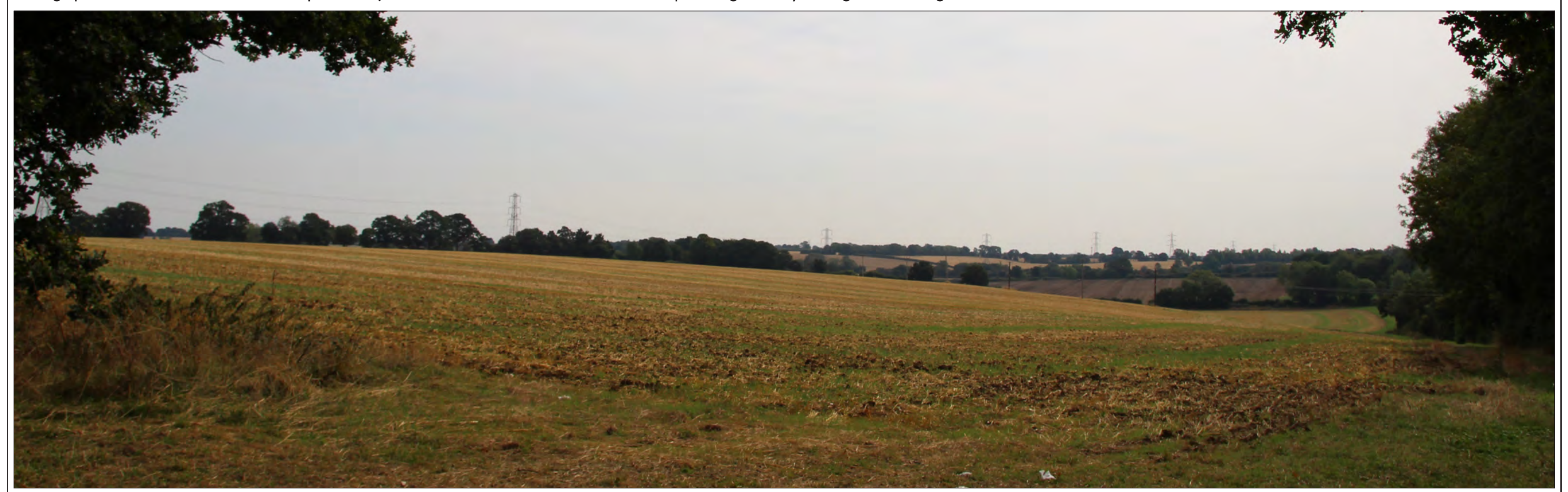
Photograph 8 - OS-602 North Hemel Hempstead: At junction between Holtsmere End Lane and public right of way through site, looking south-east