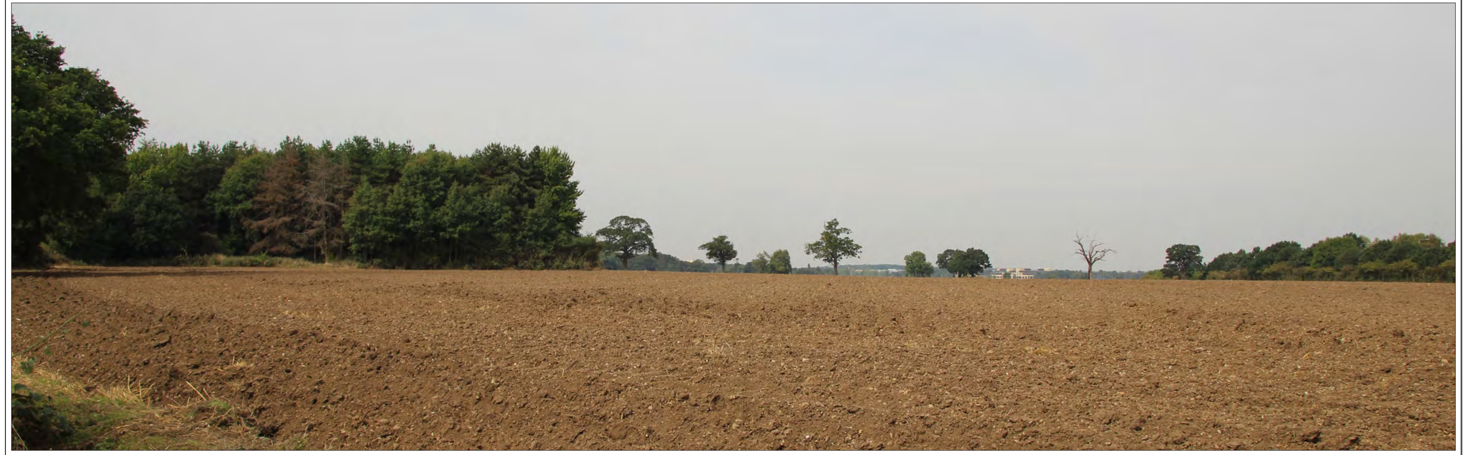
Photograph 4 - OS-400d South East Hemel Hempstead: Hemel Hempstead Road (A4147), looking north-west