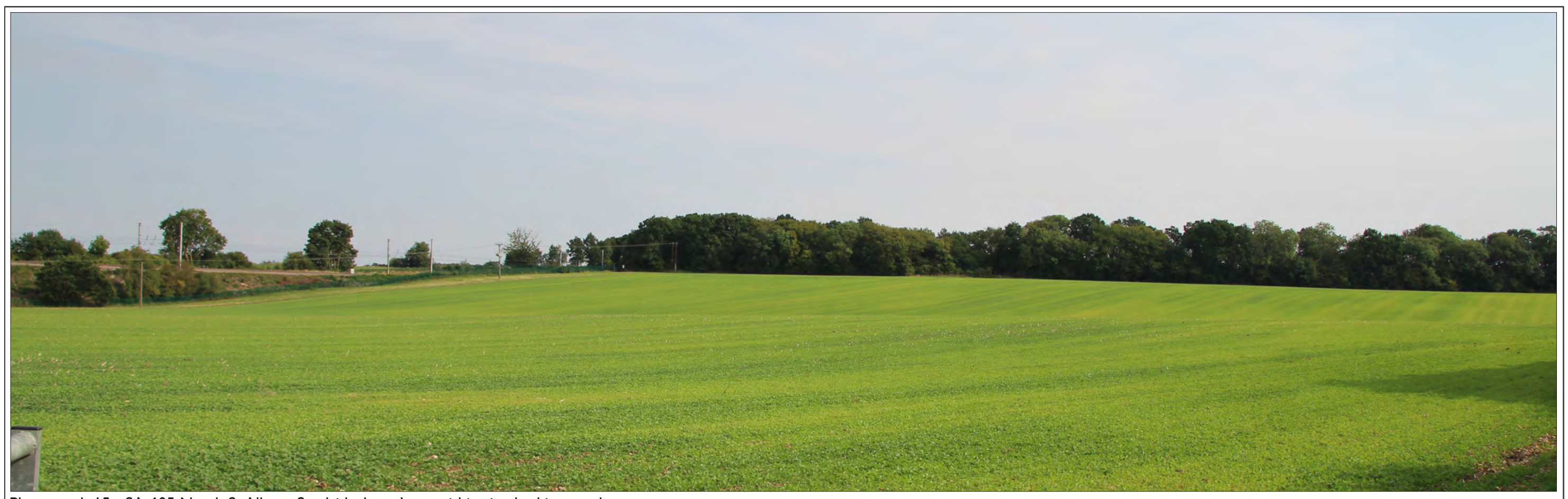
Photograph 15 - SA-605 North St Albans: Sandridgebury Lane within site, looking south-east