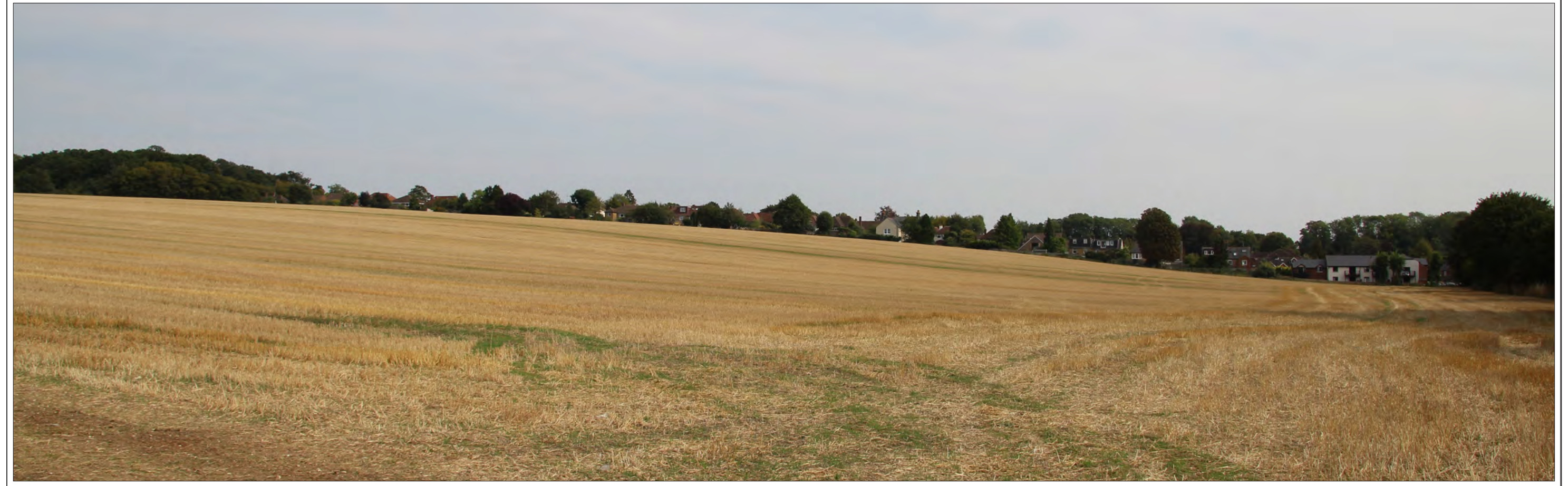
Photograph 10 - H-595 Land at North West Harpenden: At junction between Cooters End Lane and Luton Road (A1081), looking east