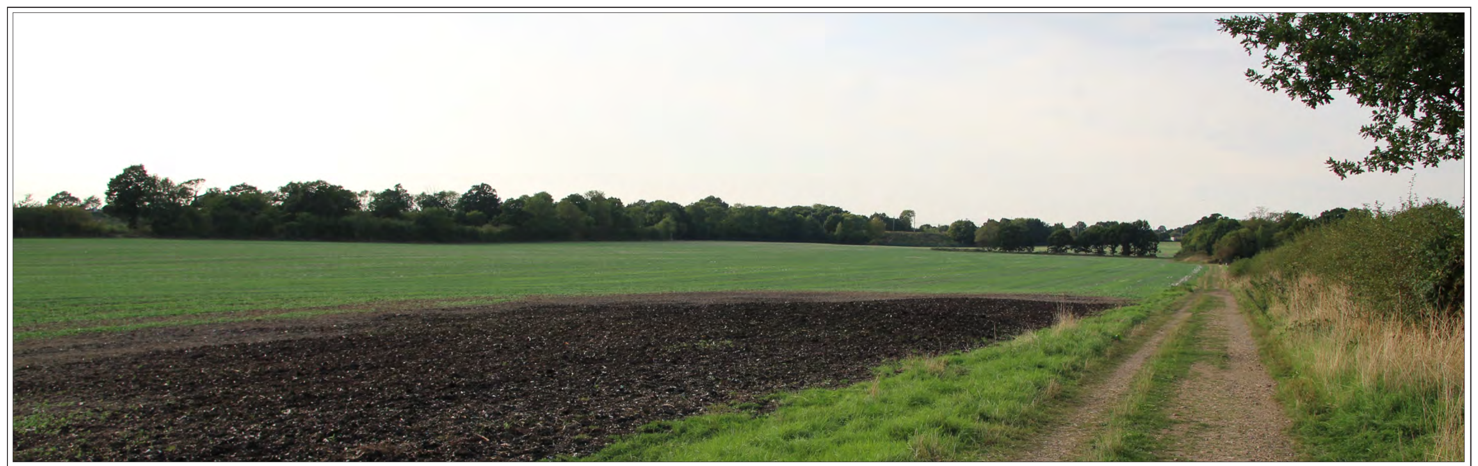
Photograph 21 - Land West of London Colney: Public right of way within western part of site, looking north