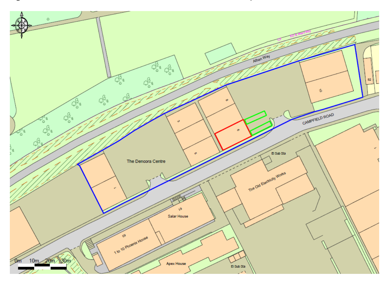
Figure 1 – Site Location Plan. The blue line shows the site boundary.

Train Station is approximately 800 metres west of the Site, providing connections to London, Gatwick and Brighton to the south, and Bedford and Luton to the north. The Site is accessed off Campfield Road.