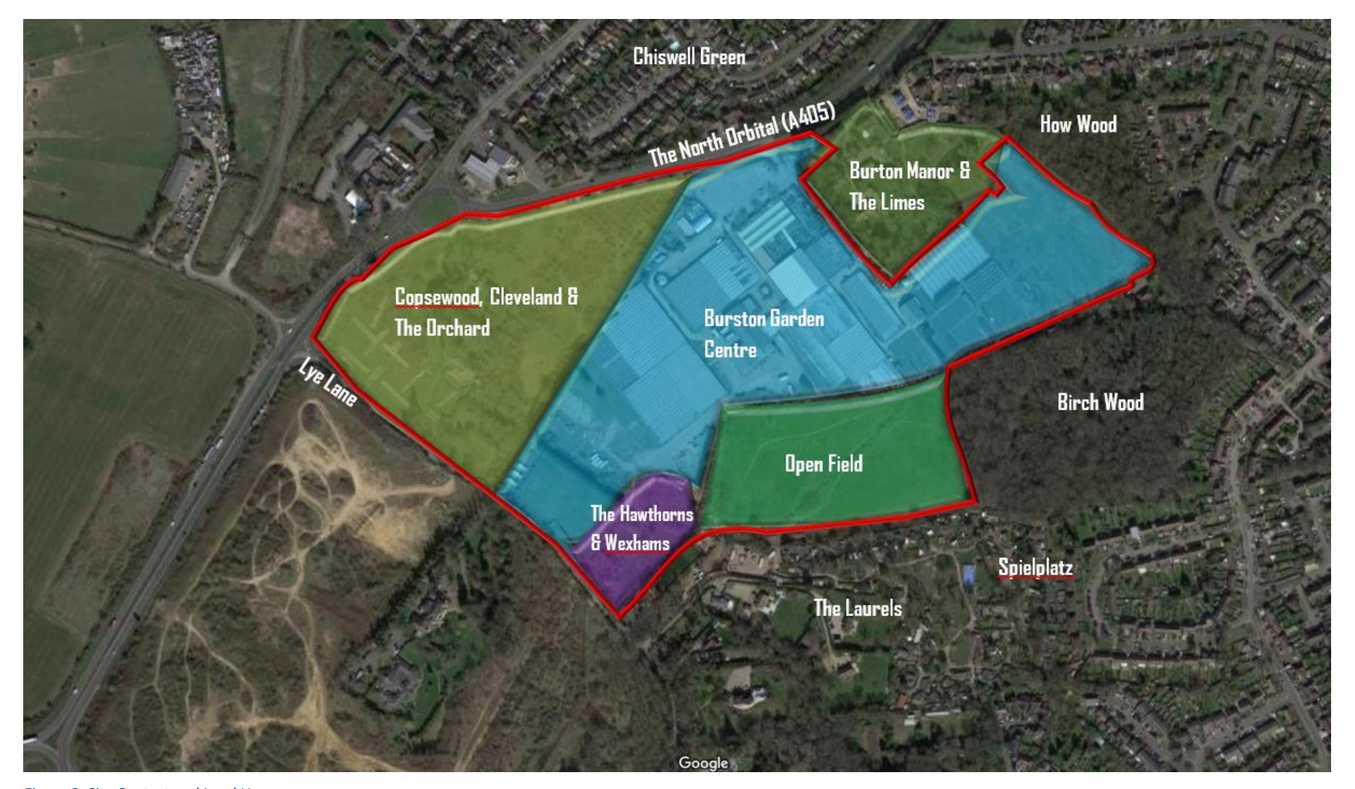
Figure 2: Site Context and Land Uses