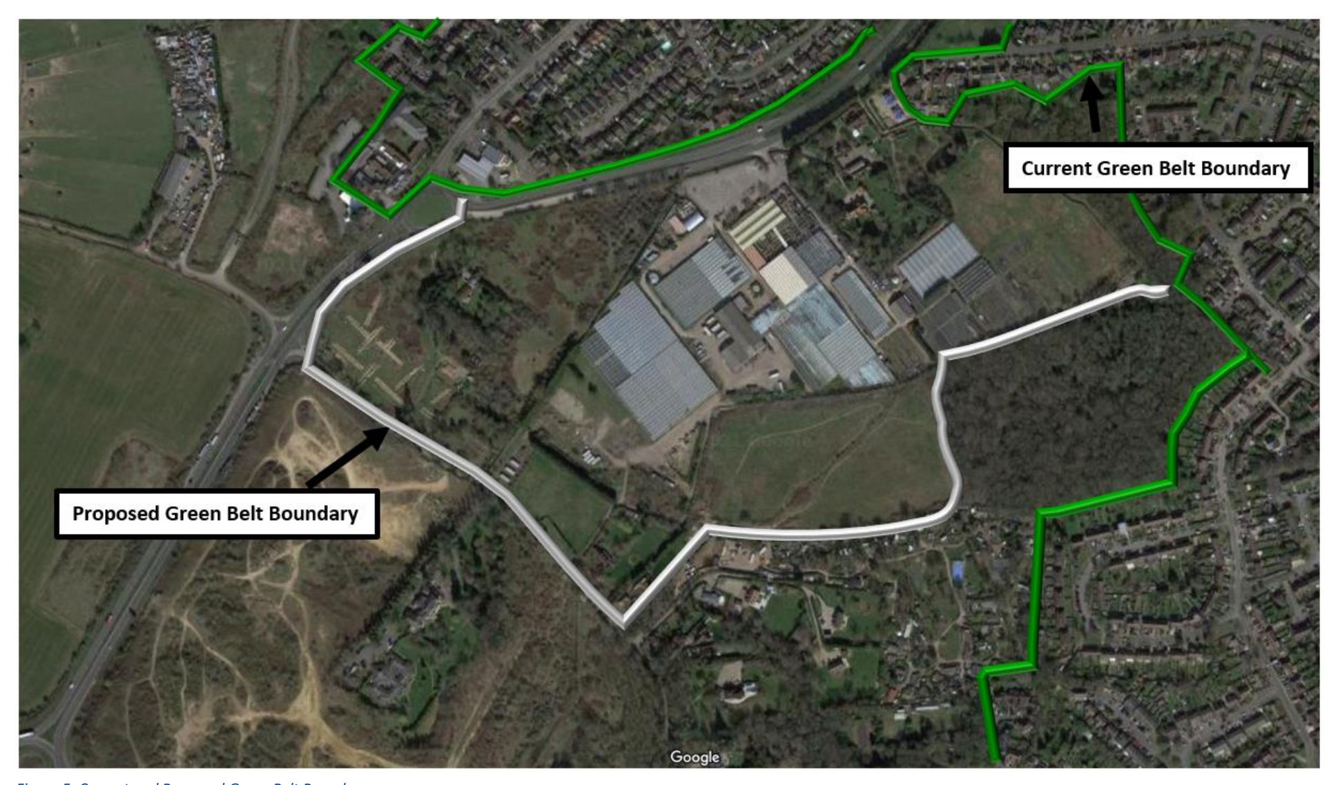
Figure 5: Current and Proposed Green Belt Boundary