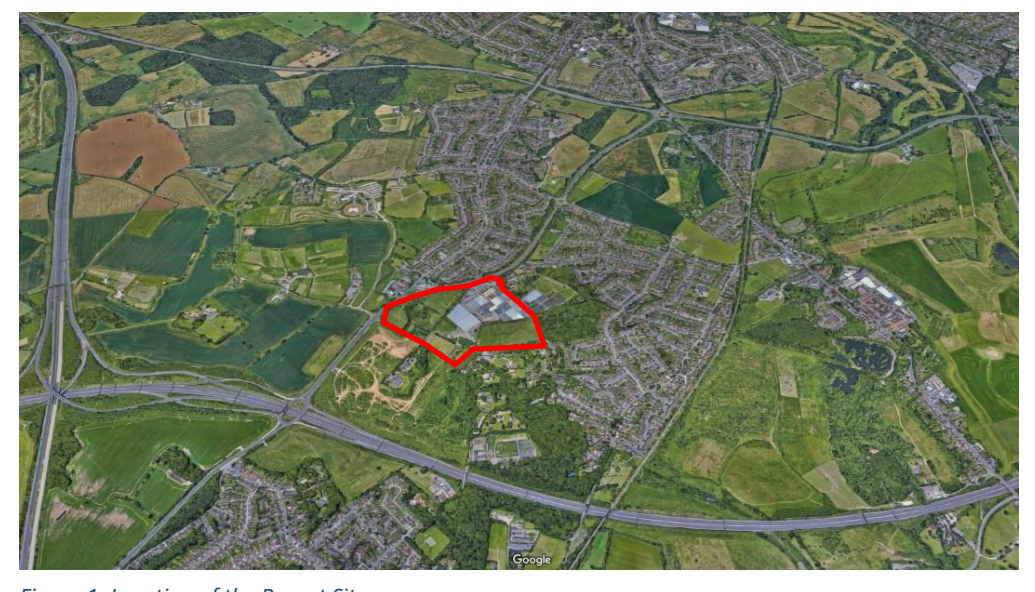
Figure 1: Location of the Report Site

The Site is located south of Chiswell Green. It is situated on the southern side of the North Orbital Road (A405) and is approximately 1.6km to the north-west of the M1 and M25 crossover. St Albans City Centre is some 3.7km to the north.