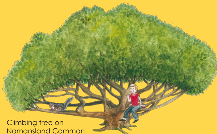
Climbing tree on Nomansland Common

Playing outside should be an integral part of every child's life. Natural play allows children's imaginations to run wild, and helps encourage a fit and healthy lifestyle by running about and being active in the fresh air.