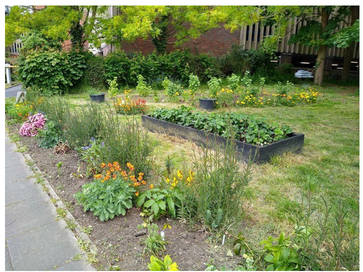
An image of FoodSmiles' Russell Avenue edible food garden in St Albans City Centre

'Grow Community – Sopwell' invite views on a community garden in Sopwell ward.