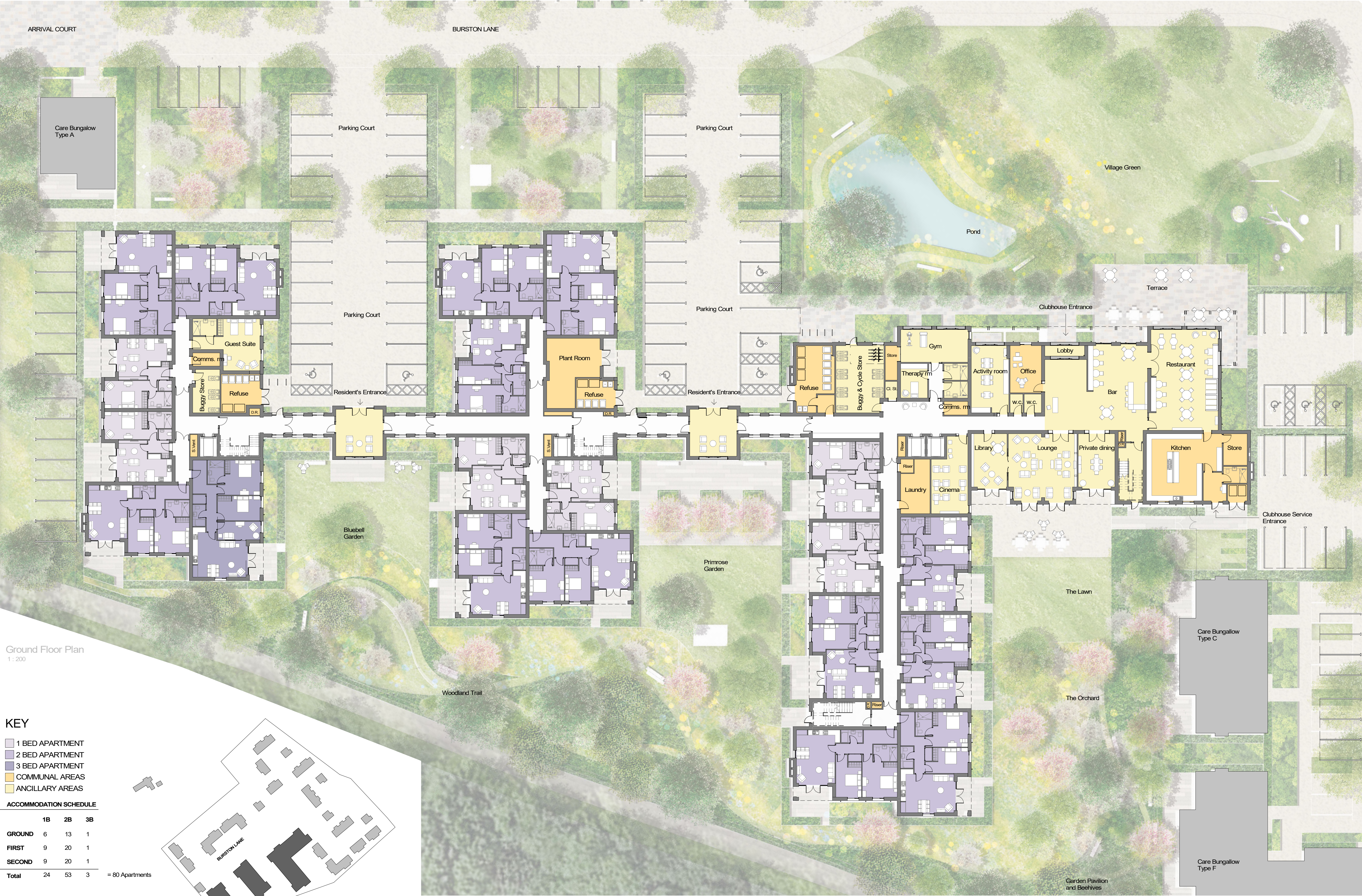
Ground Floor Plan 1 : 200