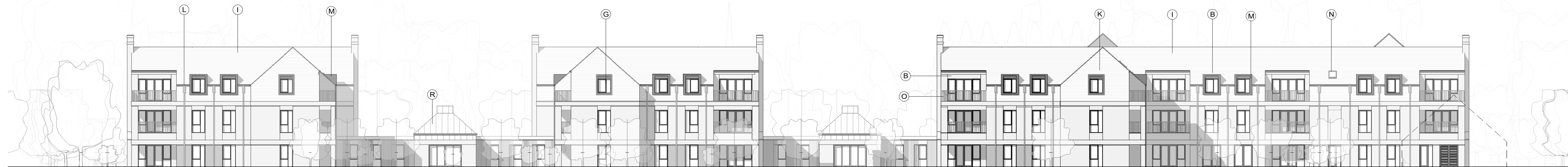
South East Elevation 1 : 200