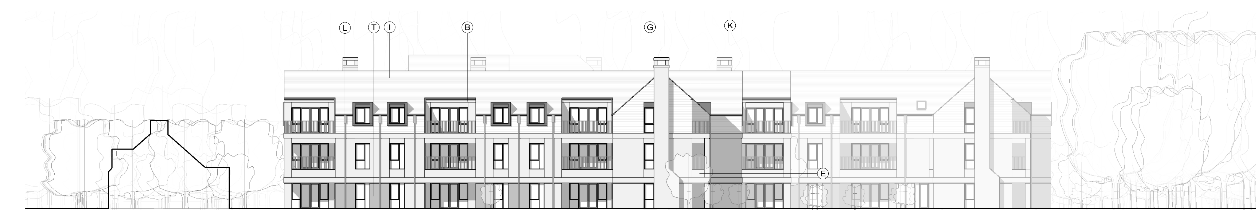
South West Elevation 1 : 200