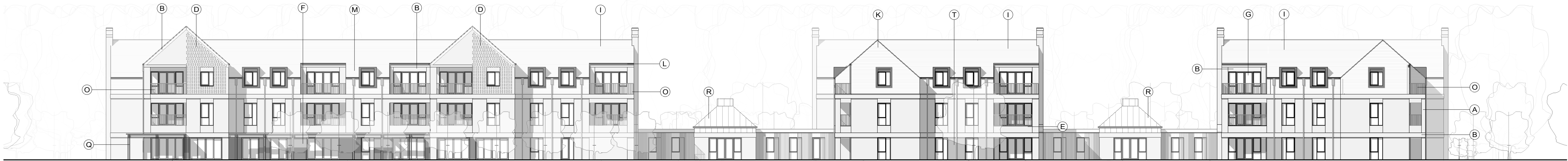
North West Elevation 1 : 200