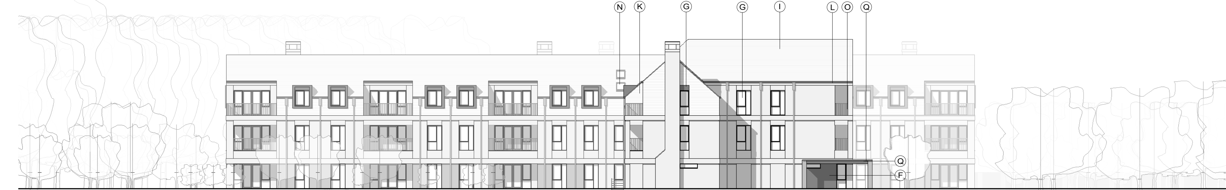
North East Elevation 1 : 200