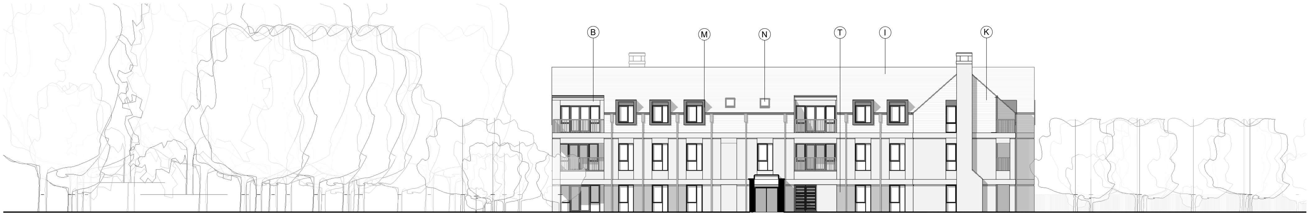
Elevation A 1 : 200