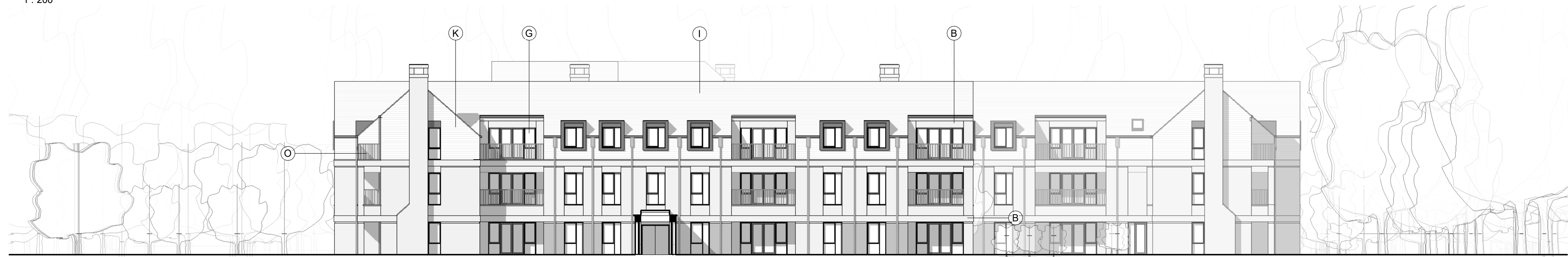
Elevation B 1 : 200