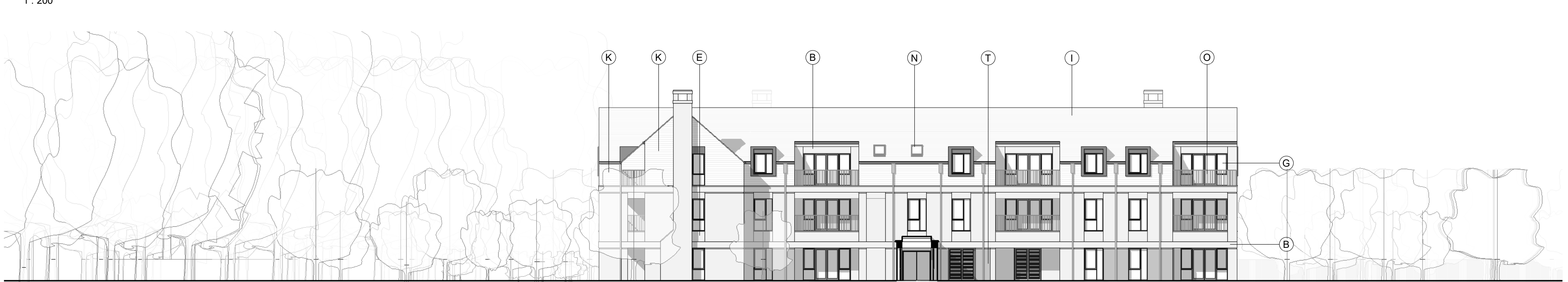
Elevation C 1 : 200