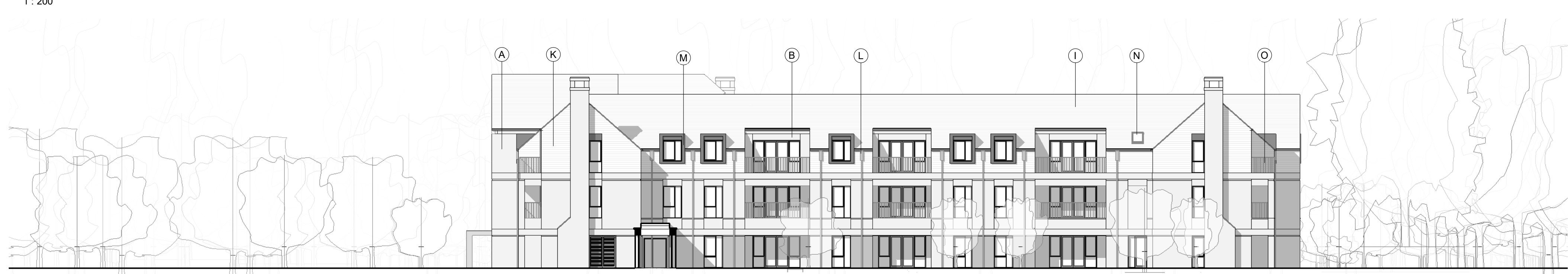
Elevation D 1 : 200