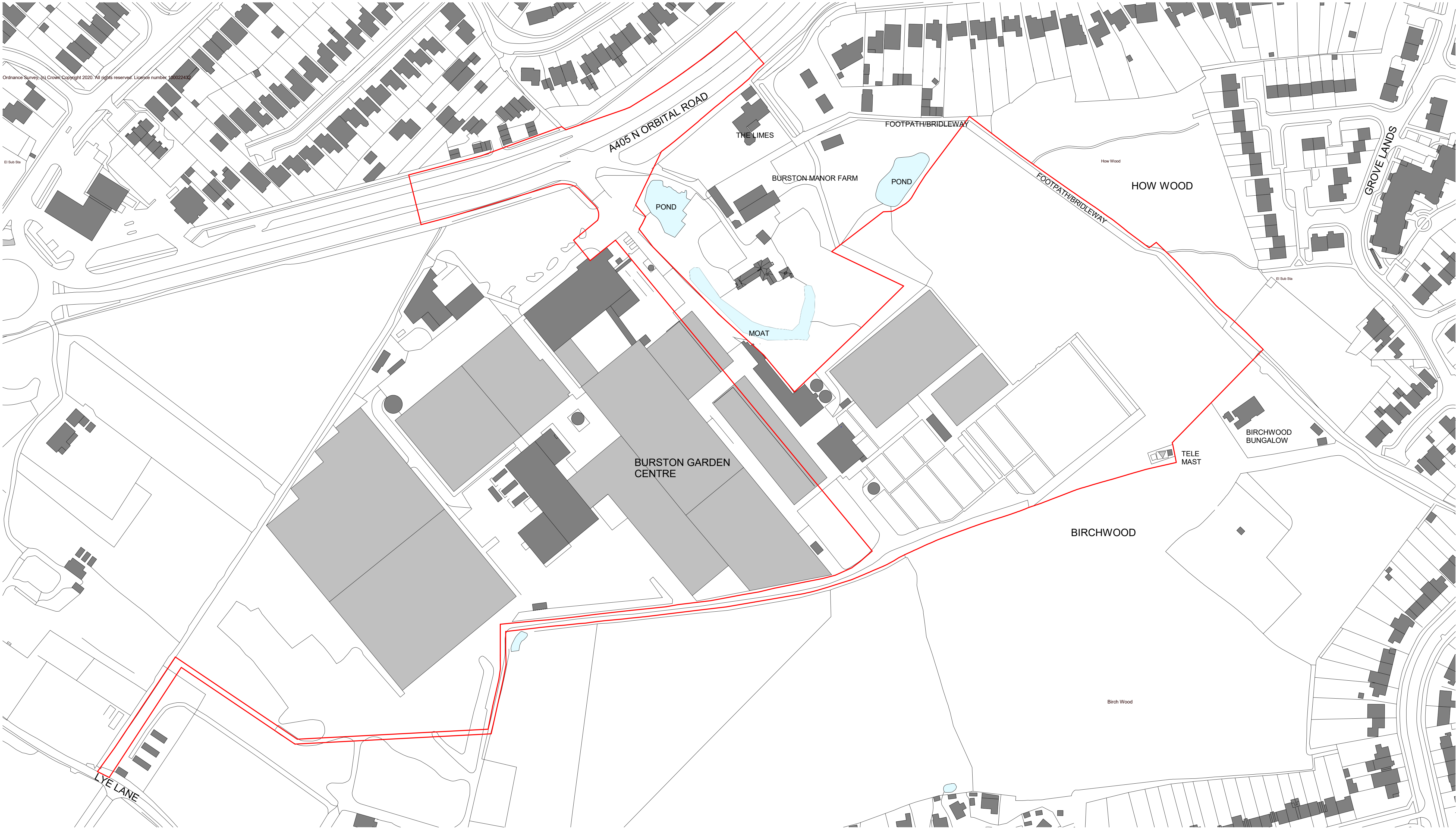
Existing Location Plan 1 : 1250

Ordnance Survey, (c) Crown Copyright 2020. All rights reserved. Licence number 100022432