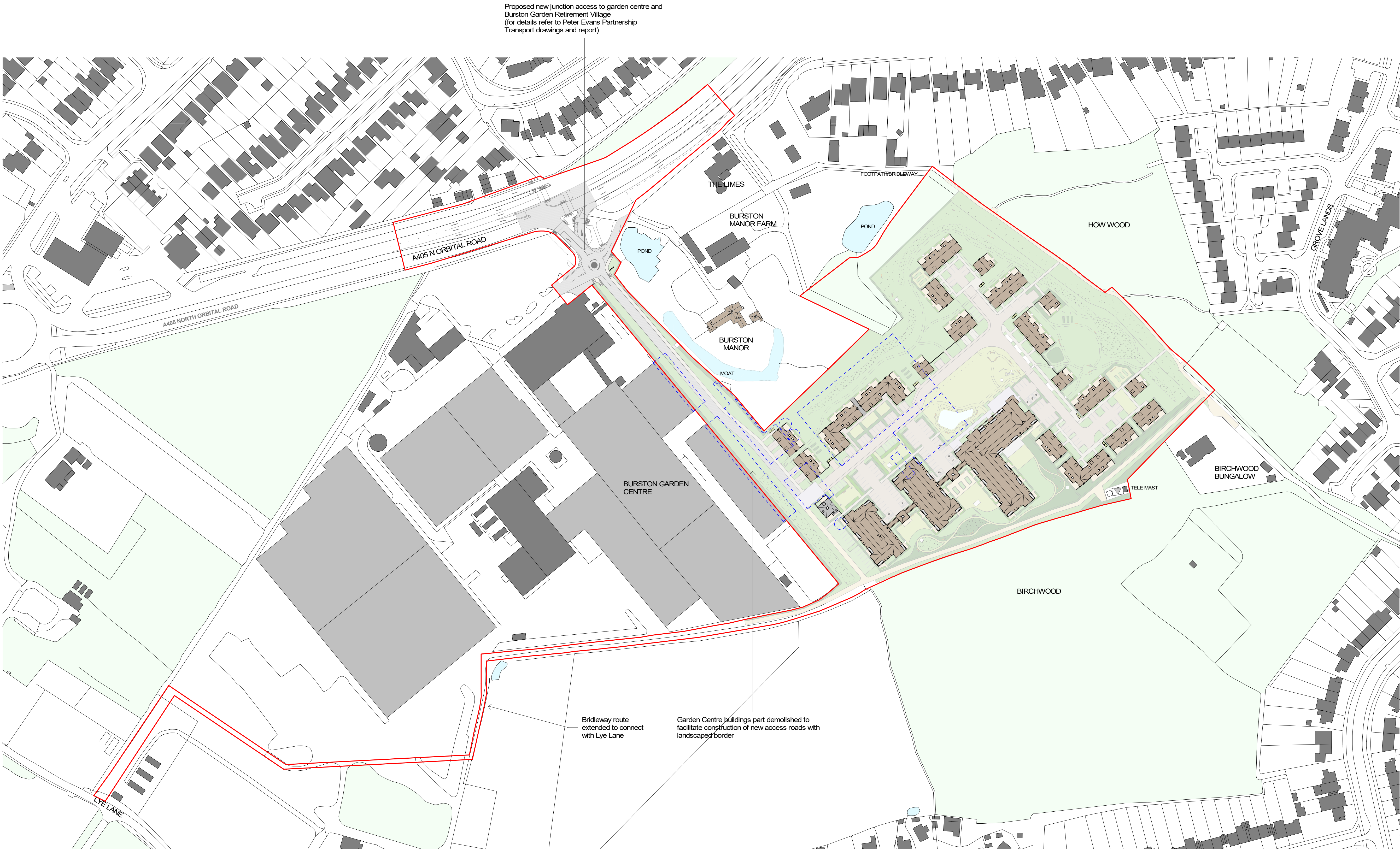
Proposed Block Plan 1 : 1250