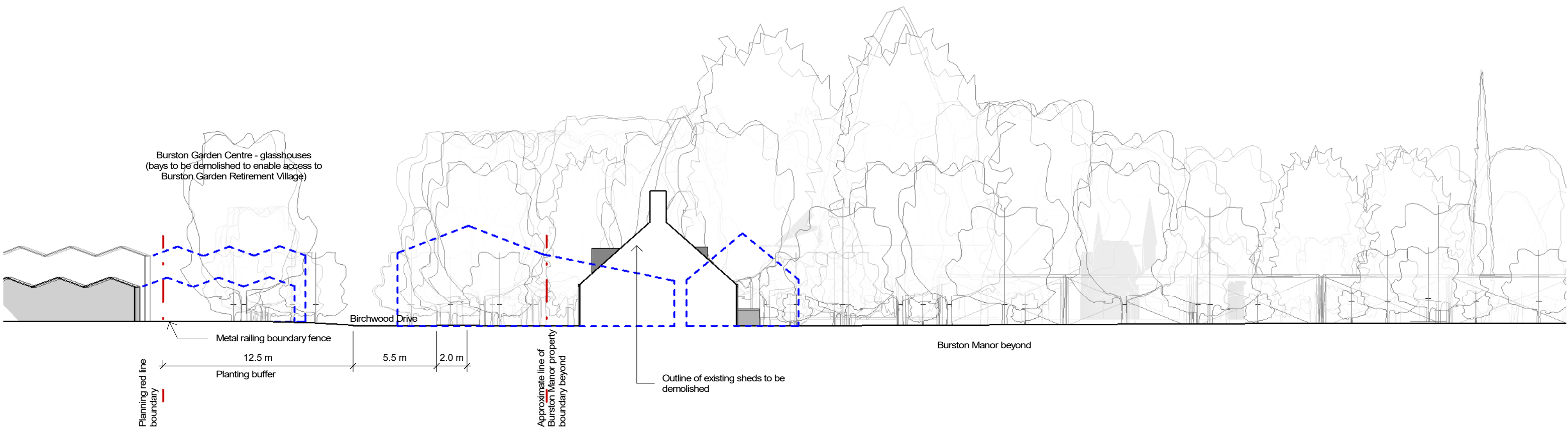
Arrival - Birchwood Drive Section 2 1 : 250