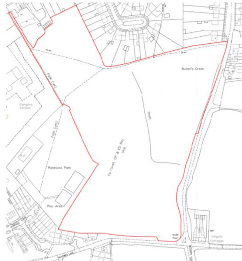
PA Location Plan

within a longer PROW route. Also note that the south-west section of PFP CH23 (not shown on the application plan) and PFP CH44 link to the east section of PFP CH48 along a non-PROW path (shown on the application plan) across the development site: