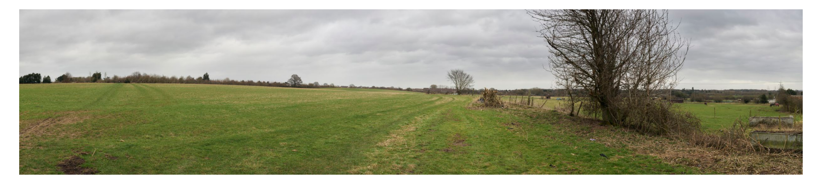
01.8 Final camera matched photomontage