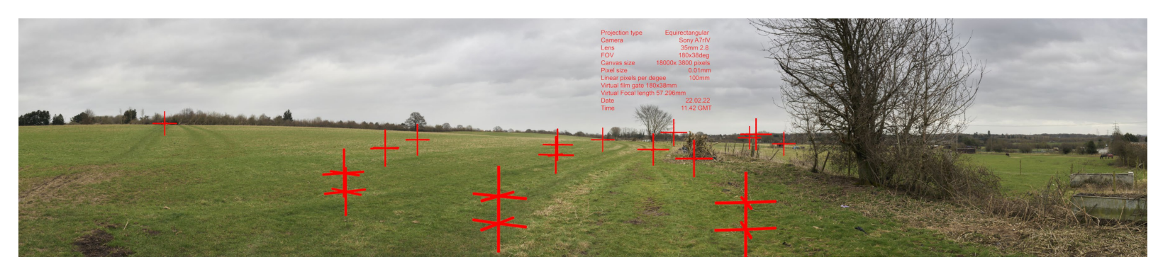
01.6 Screen grab of camera matching to OS data