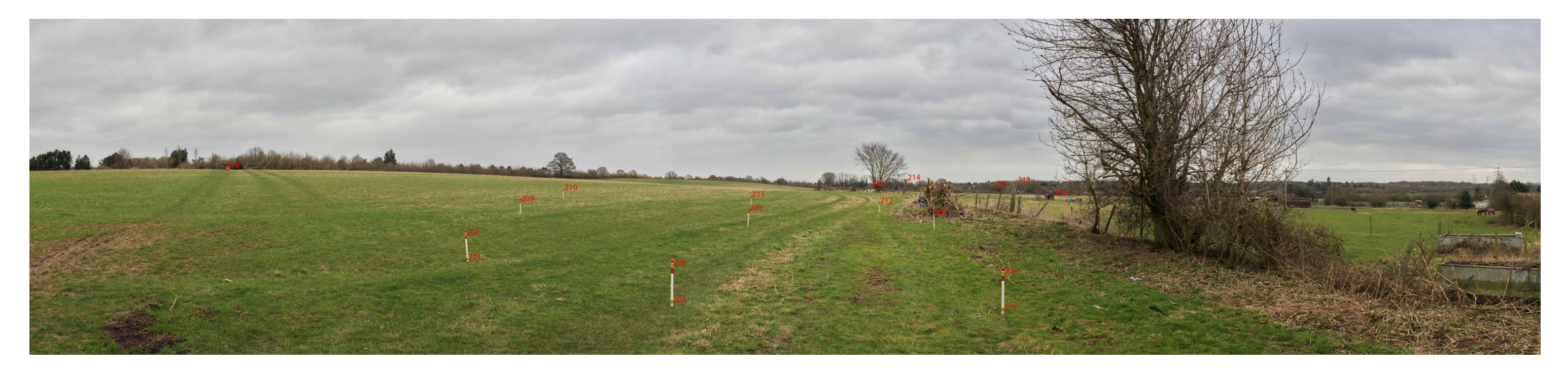
01.2 OS survey points marked on photograph