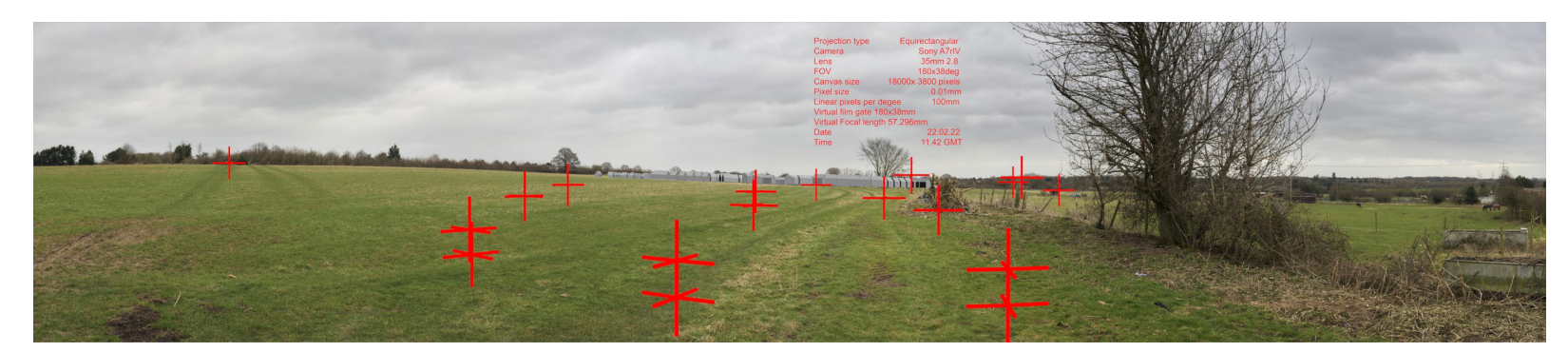
01.7 Screen grab of wireline model matched to photograph