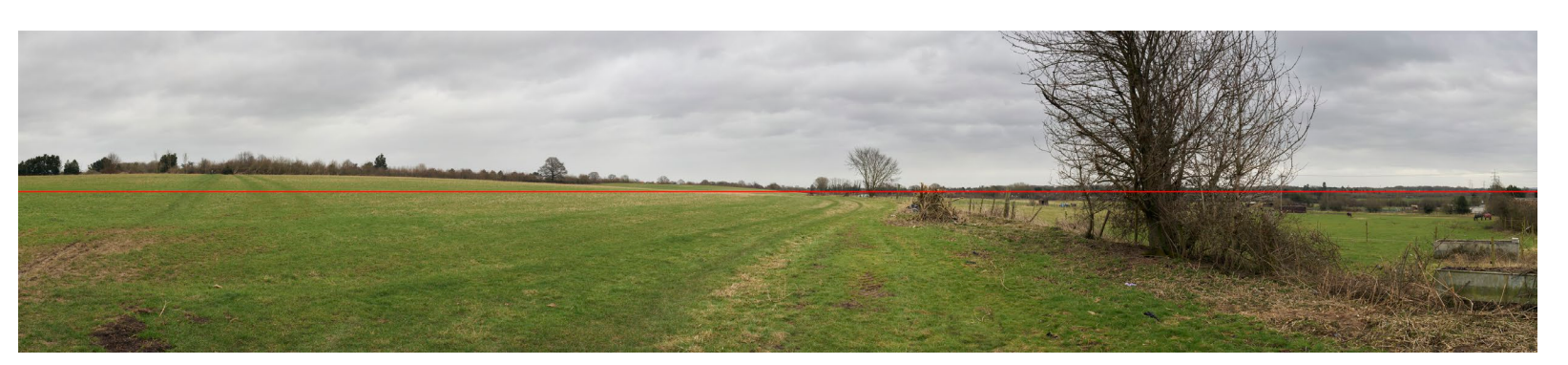
01.5 Screen grab of calculated horizon line