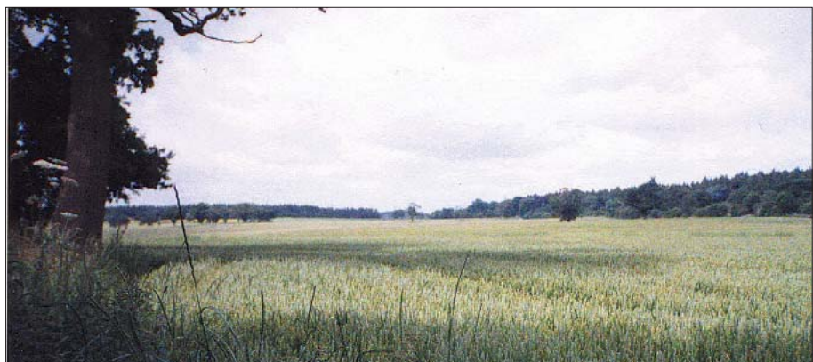
Wooded farmland from • Bedmond Lane