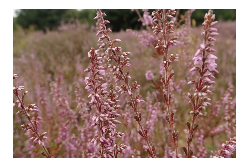
Heather (Calluna vulgaris)