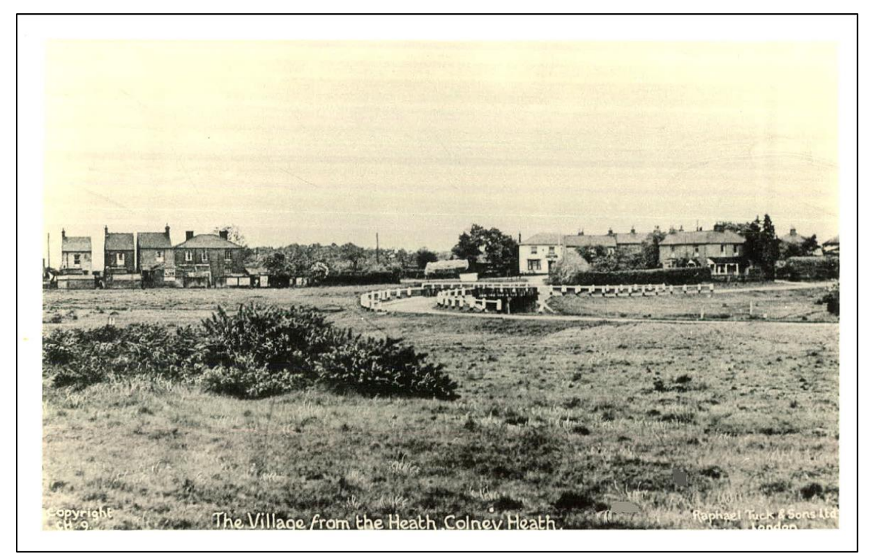
Figure 1. Postcard view of the Common from c1920s showing Heather and Gorse on the North Common. In precisely this area there is now a block of woodland where the succession of the dwarf shrub heath has not been halted (image obtained from Hertfordshire Environmental Records Centre).