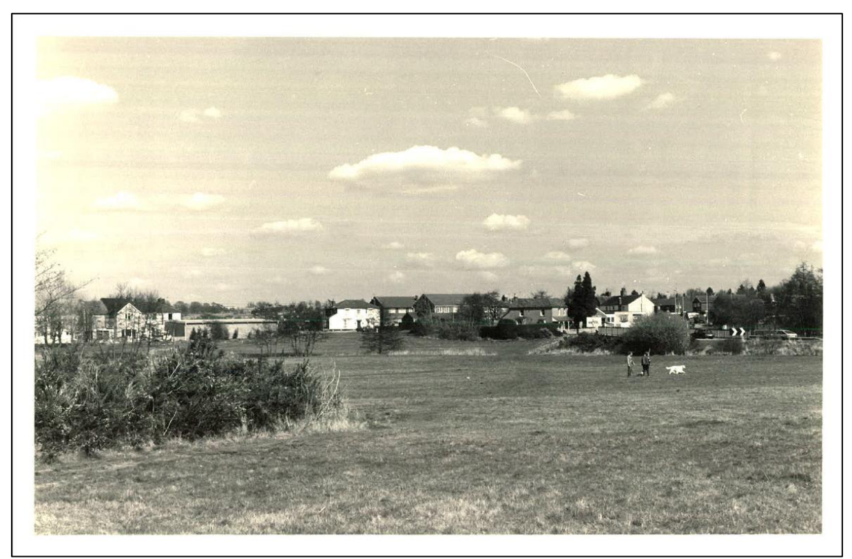
Figure 2. Postcard view of the Common from1984 taken from approximately the same view. This shows the elimination of heathland species through the development of scrub (left) and regular mowing of Heather.