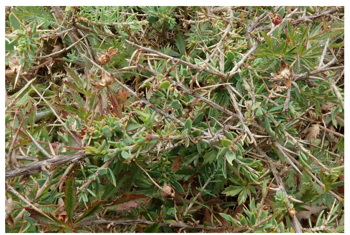
A specimen of Petty Whin (Genista anglica), a Herts species of conservation concern

The survey in 1992 (Wyatt and Clarke) note two additional areas of heathland dominated by Heather to the southeast of the current patch. This corresponds presently to large blocks of scrub. Near to this Heath Grass and Heath Dog-violet can be found, and when the scrub was examined, the remnants of dwarf shrub heath could be found within, suggesting a more recent origin of scrub. The remnant of a hedge also lies across the heath.