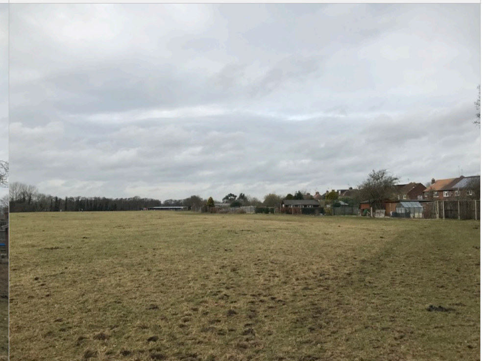
IMAGE 6: looking northwest across the site to the residential gardens adjoining the site.