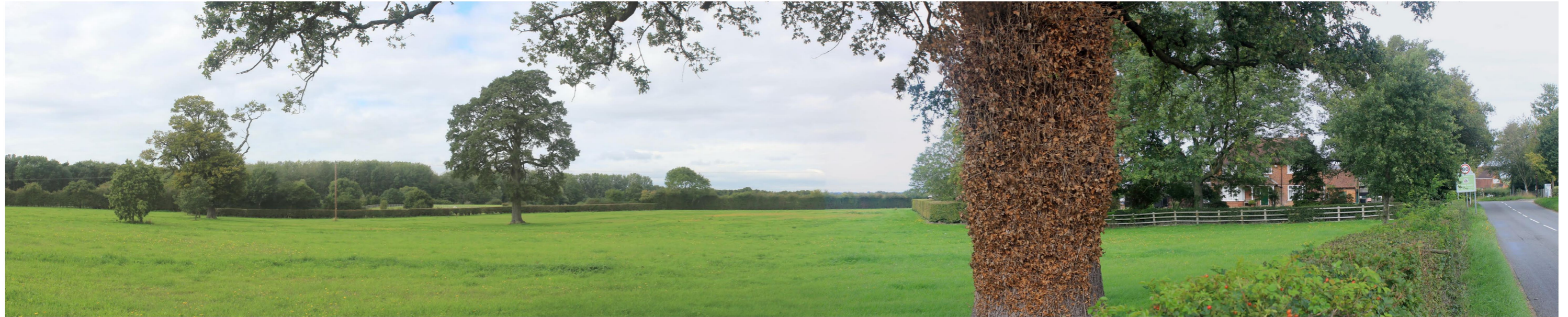
Photograph 16 View towards the Site from Tollgate Road south of Tollgate Farm