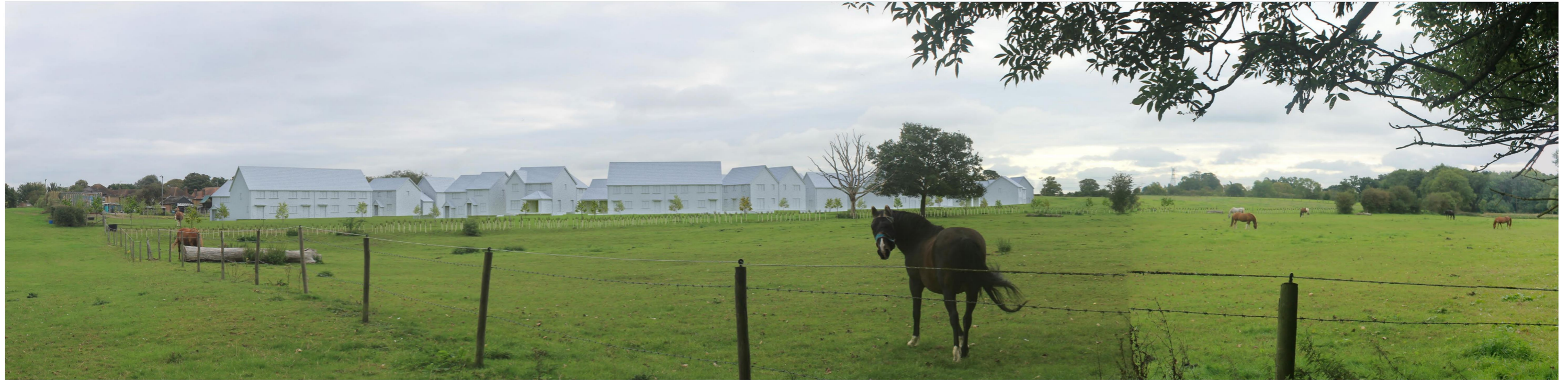
Photomontage from Viewpoint 07 - Year 1 View south east over the Site from public footpath 33