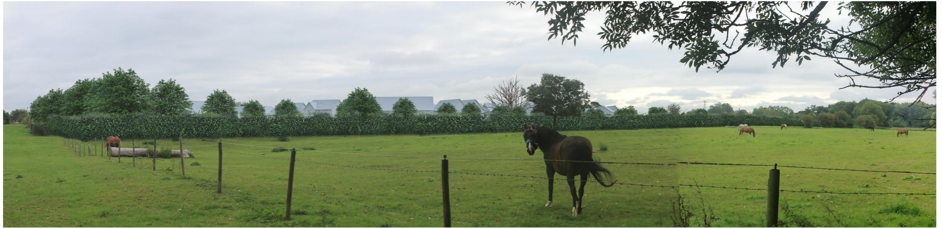
Photomontage from Viewpoint 07 - Year 15 View south east over the Site from public footpath 33