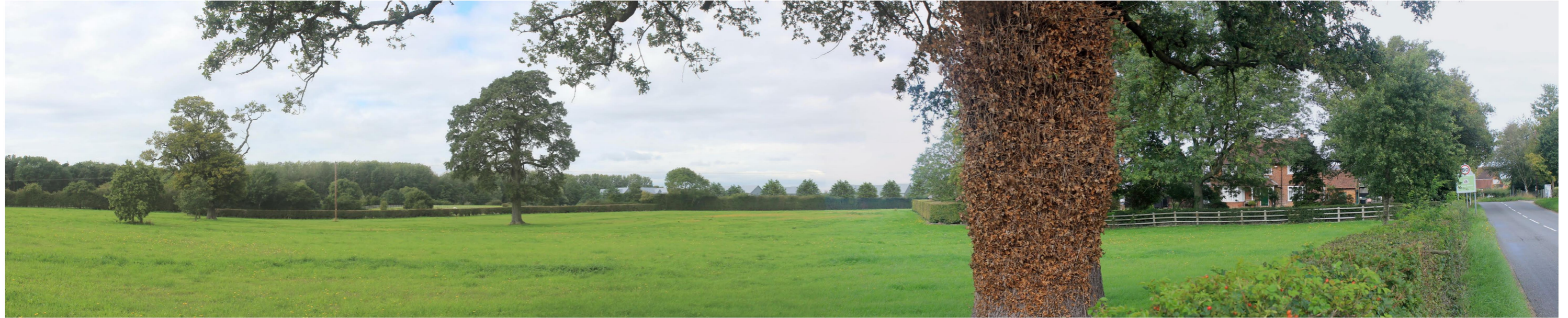
Photomontage from Viewpoint 16 - Year 15 View towards the Site from Tollgate Road south of Tollgate Farm