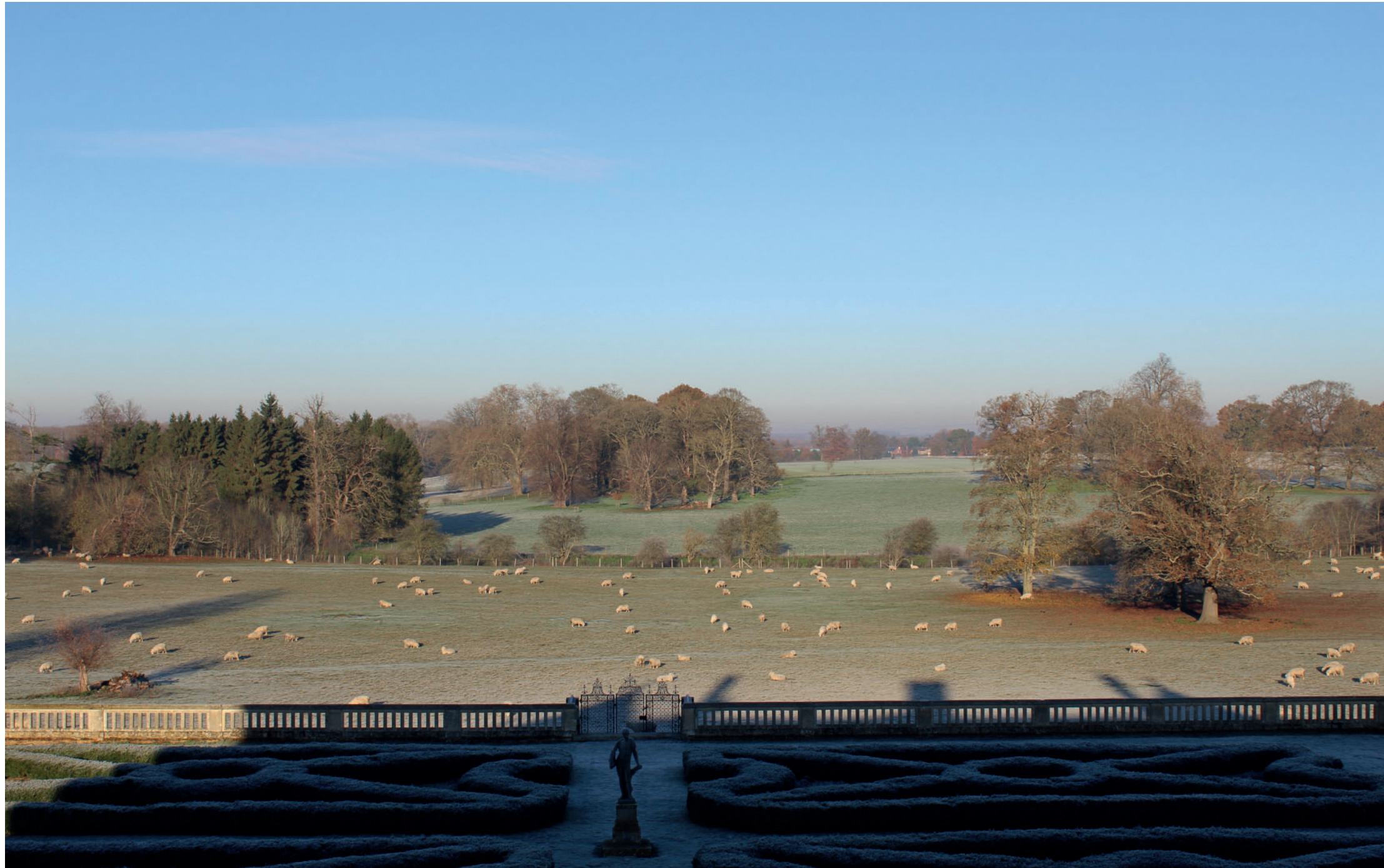
Photomontage from the central bay of the first floor window at Norh Mymms House - Year 15