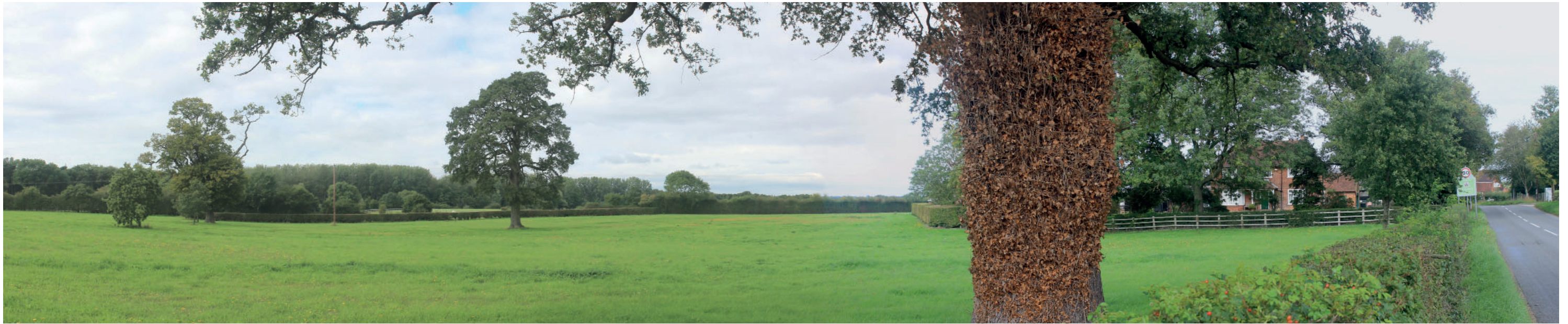
Photograph 16 View towards the Site from Tollgate Road south of Tollgate Farm