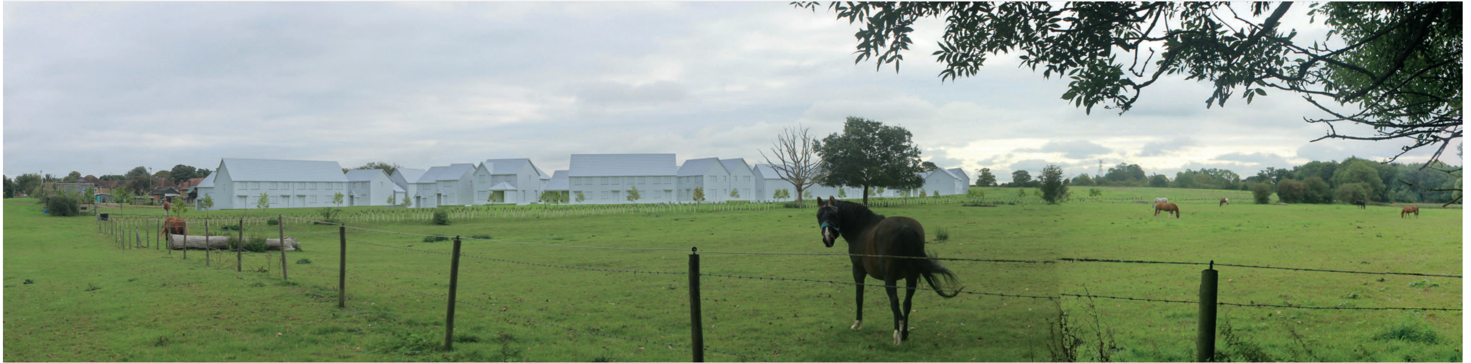
Photomontage from Viewpoint 07 - Year 1 View south east over the Site from public footpath 33