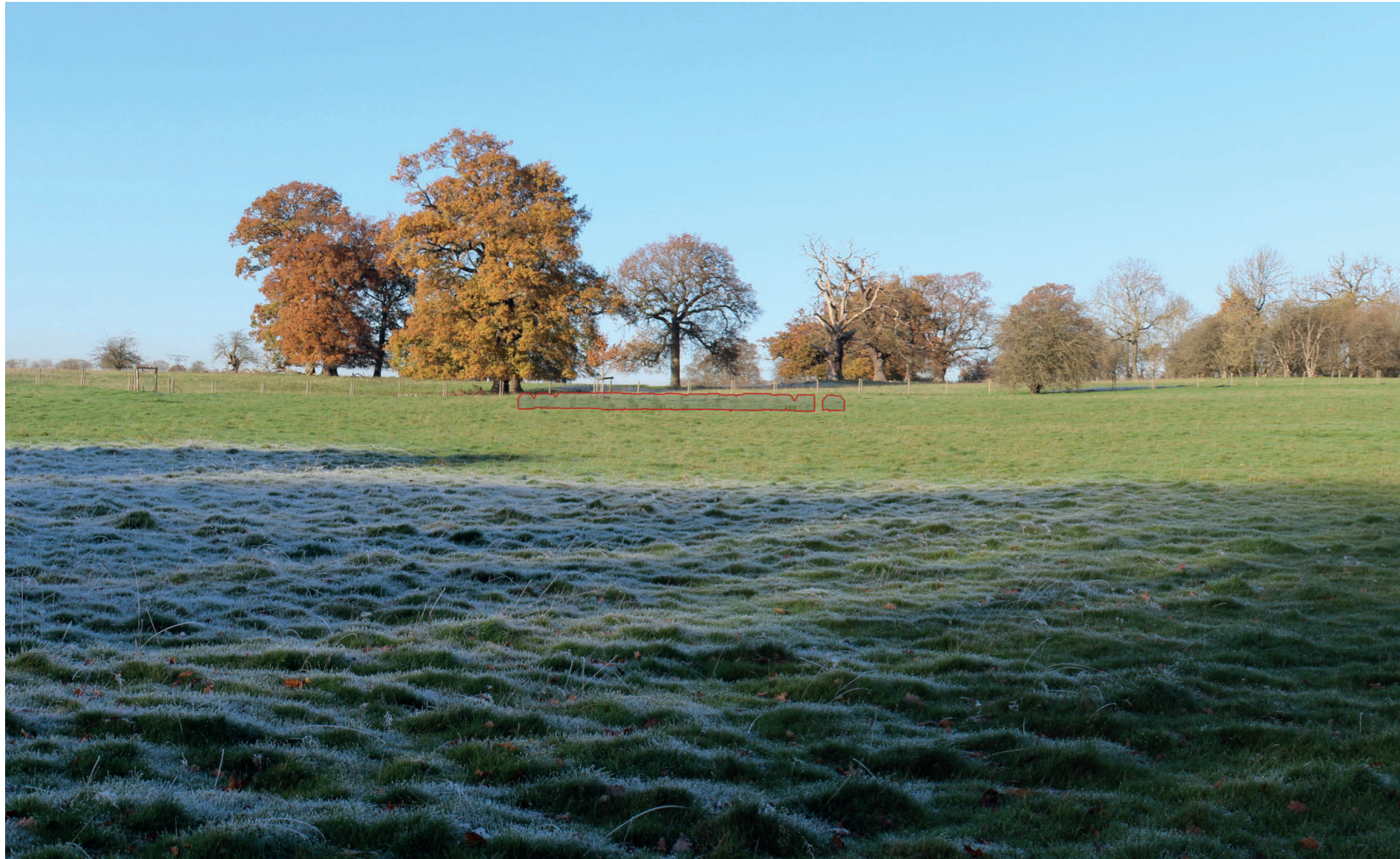
Wireline Photomontage from public footpath North Mymms 029 within North Mymms Park (proposals are not visible due to intervening landform)