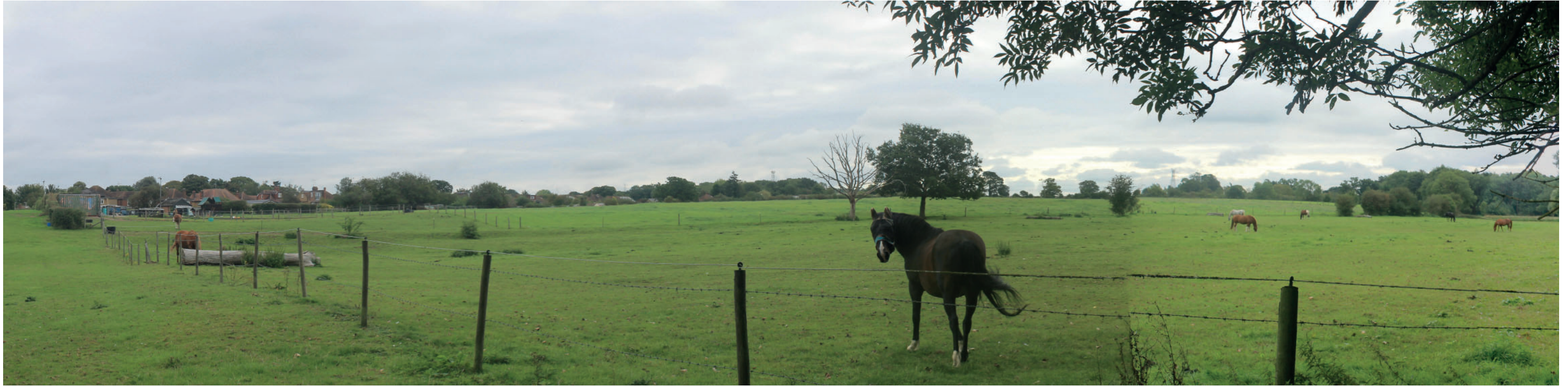
Photograph 07 View south east over the Site from public footpath 33