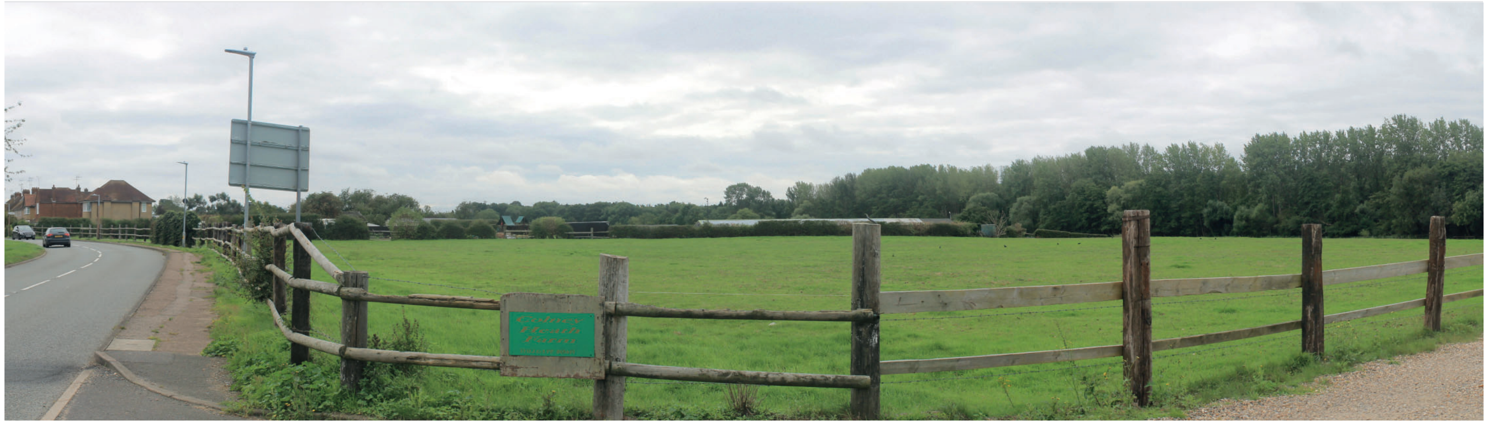
Photograph 13 View south towards the Site from Tollgate Road