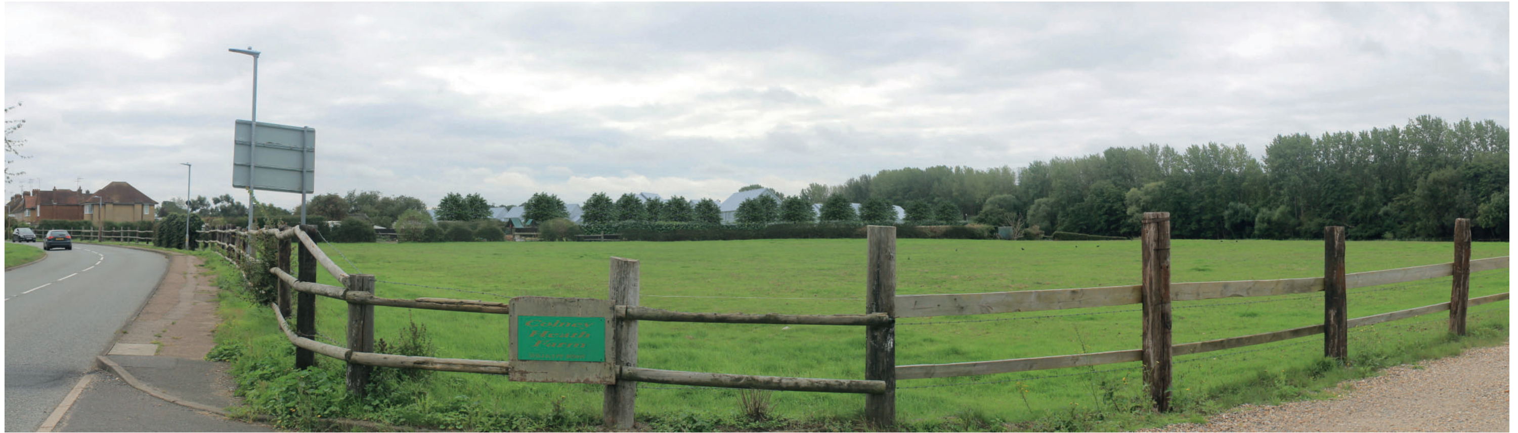
Photomontage from Viewpoint 13 - Year 15 View south towards the Site from Tollgate Road