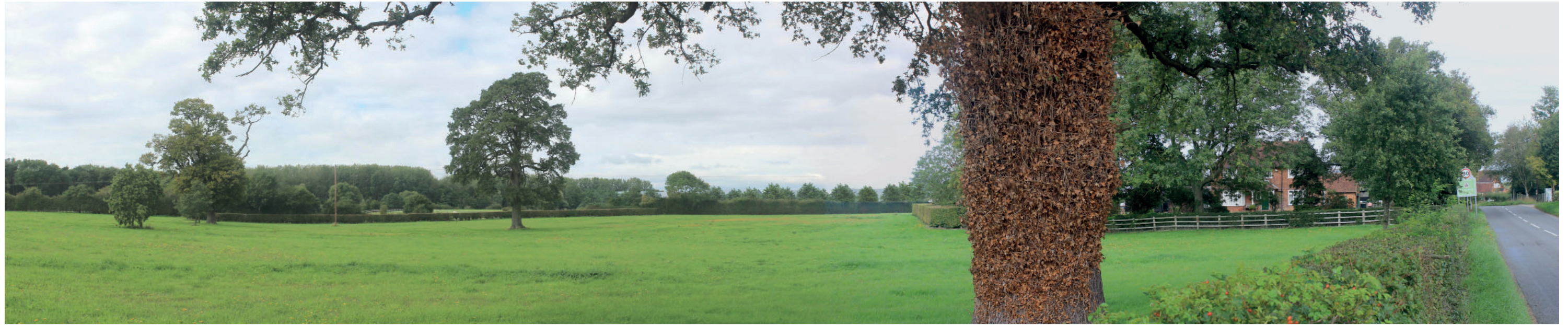
Photomontage from Viewpoint 16 - Year 15 View towards the Site from Tollgate Road south of Tollgate Farm