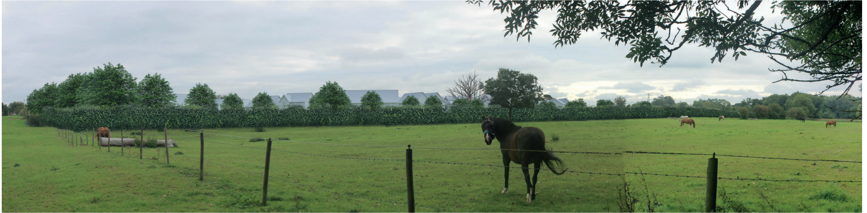
Photomontage from Viewpoint 07 - Year 15 View south east over the Site from public footpath 33