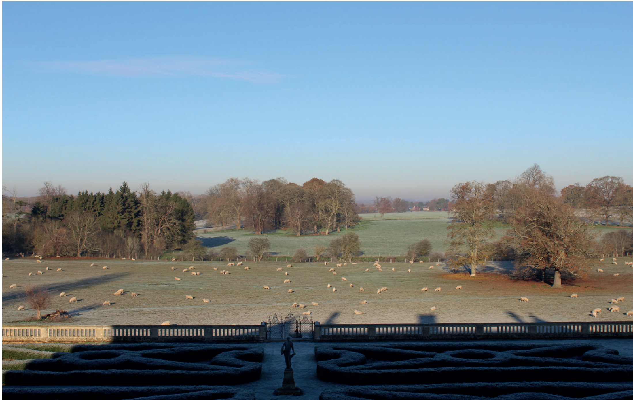
Existing View from the central bay of the first floor window at North Mymms House