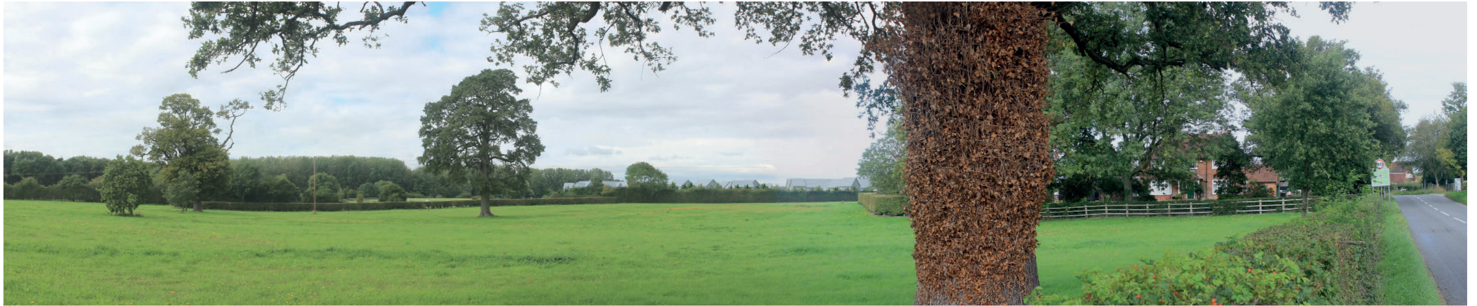
Photomontage from Viewpoint 16 - Year 1 View towards the Site from Tollgate Road south of Tollgate Farm