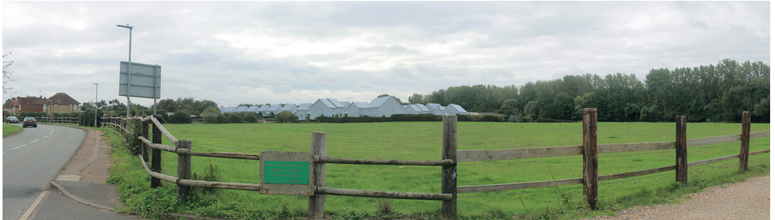
Photomontage from Viewpoint 13 - Year 1 View south towards the Site from Tollgate Road