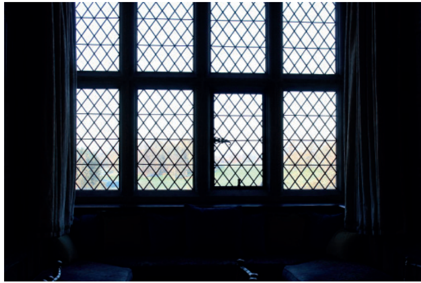
View of the window from the interior