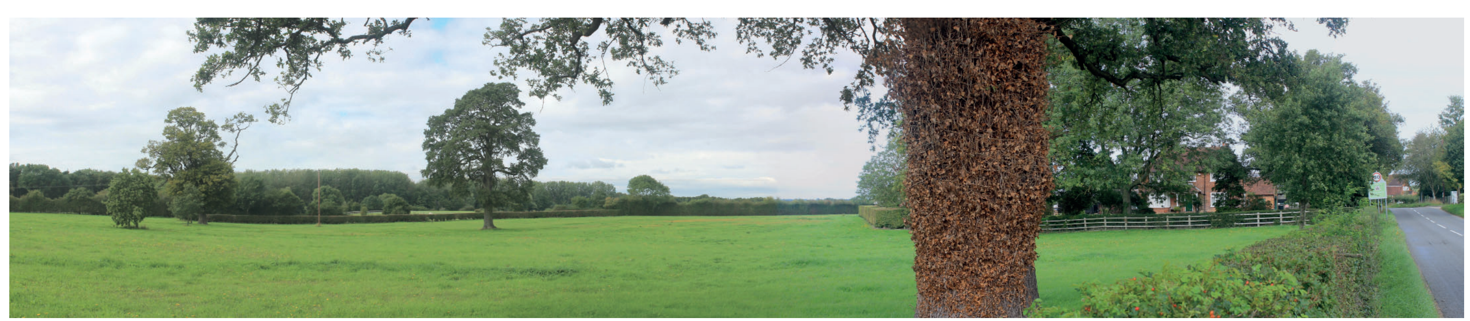
Photograph 16 View towards the Site from Tollgate Road south of Tollgate Farm

Planar projection 75% @ A3, 150% @ A1 08.09.2020, 11:15 HfoV 90° Looking direction: west