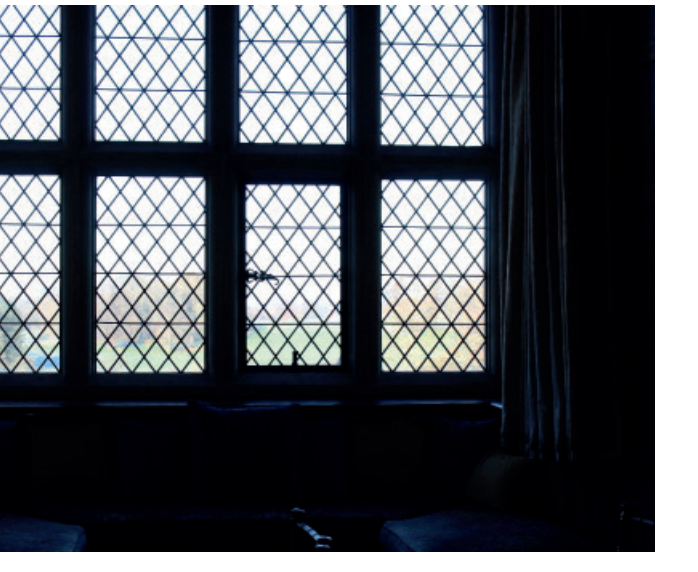
View of the window from the interior