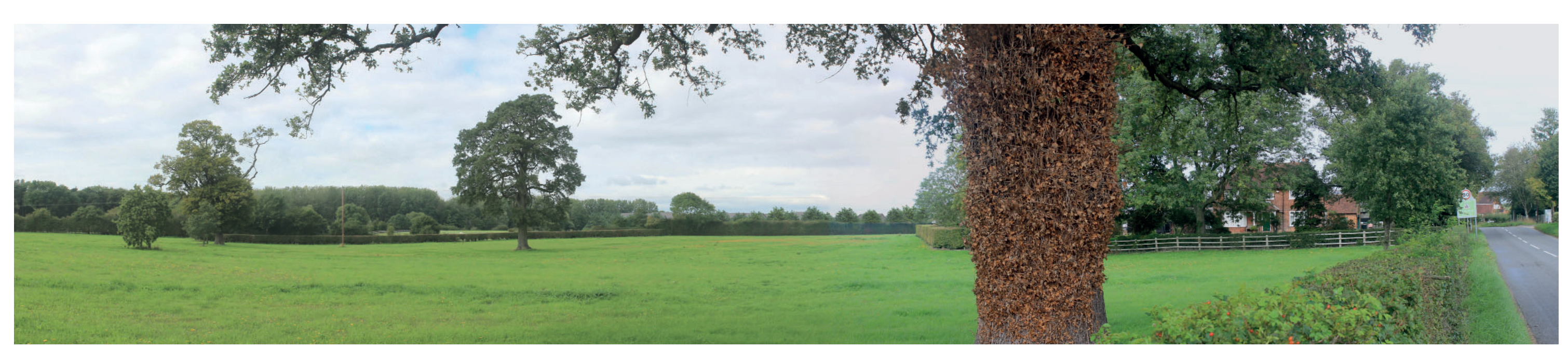
Massing Model Photomontage from Viewpoint 16 - Year 15 View towards the Site from Tollgate Road south of Tollgate Farm