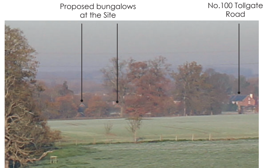
Zoomed-in extract of the below photomontage