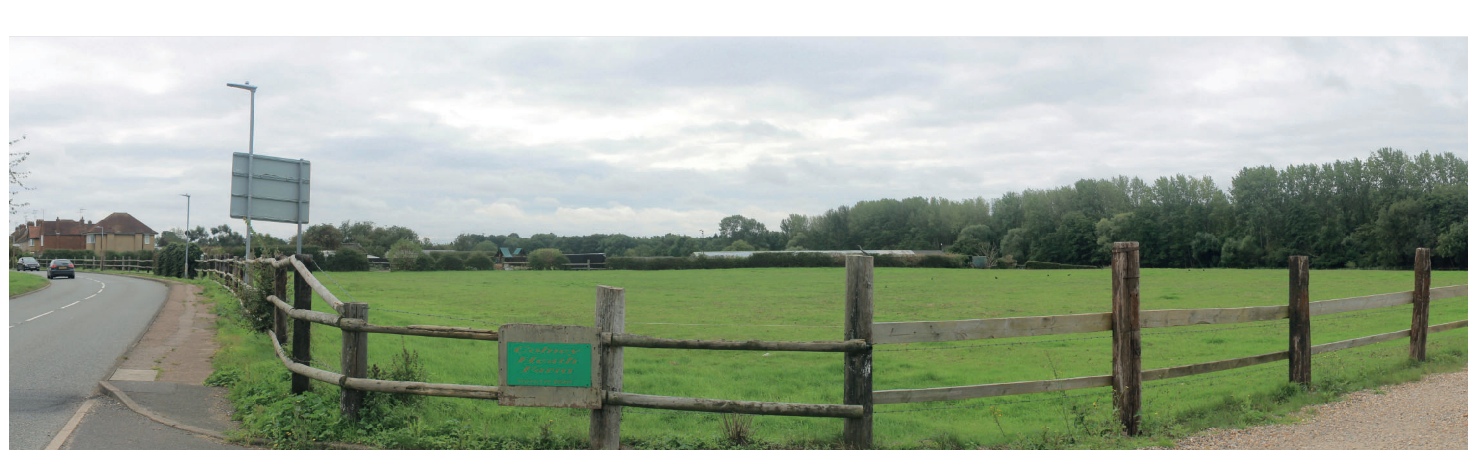
Photograph 13 View south towards the Site from Tollgate Road