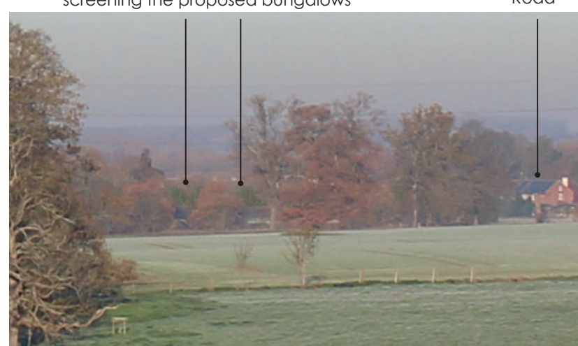
Zoomed-in extract of the below photomontage