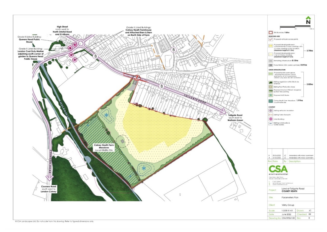
The appellant's parameters plan CD 4.22 showing the appellant's proposed development areas.