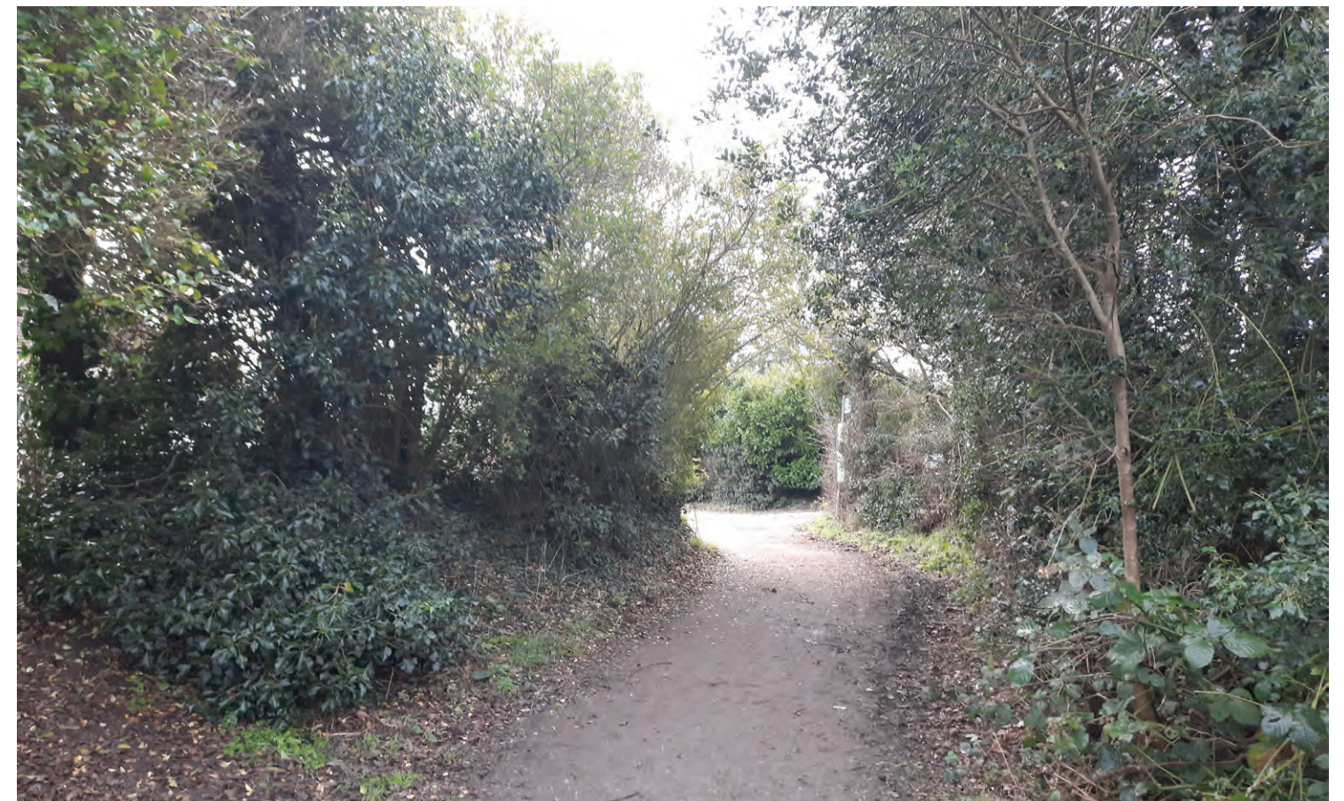
Tree and hedgerow lined footpaths and roads give the hamlet a rural and enclosed character