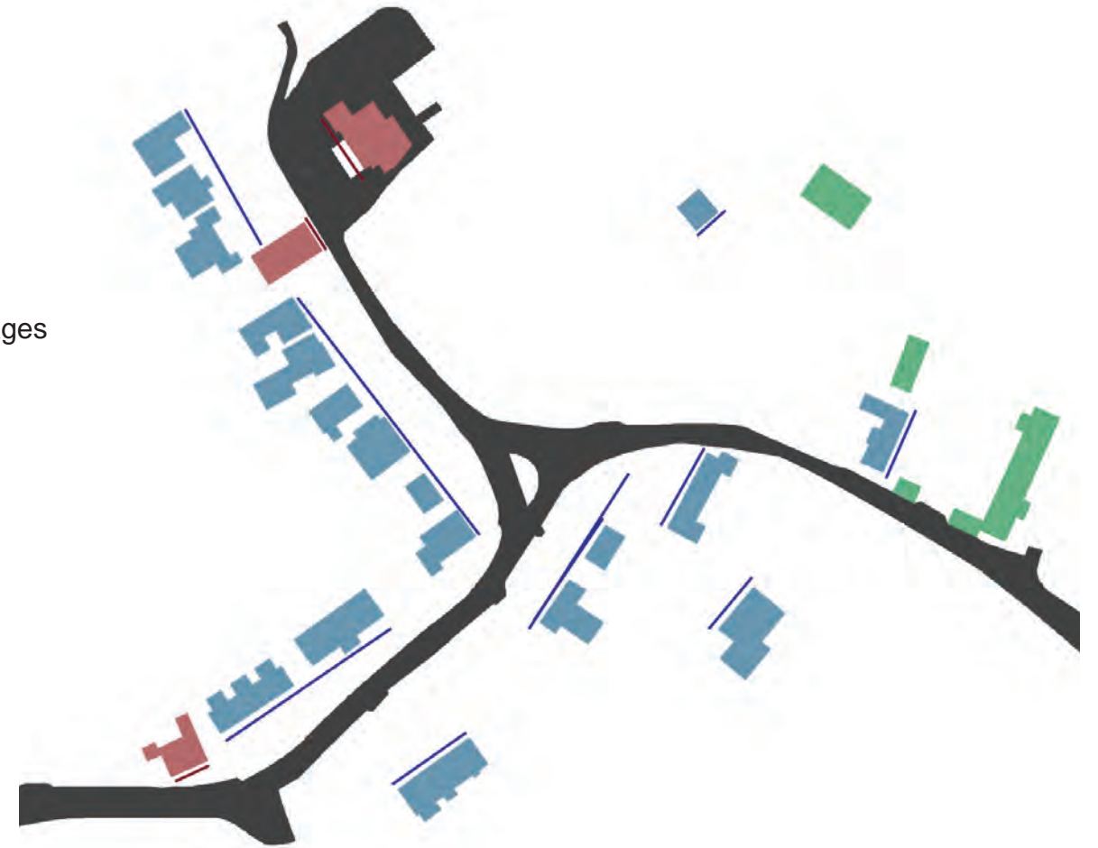
Figure 4: The map shows the historic, original building uses within the Conservation Area and their relationship to the street

Key: Original building use Public Residential Agricultural Road Public frontages Residential frontages