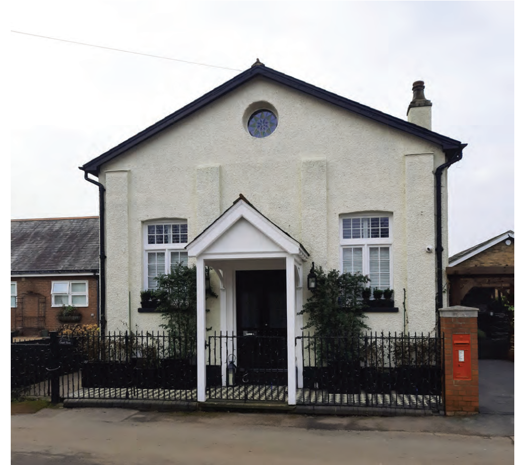
The former Methodist Chapel retains its simple but distinctive elongated form indicative of its former use