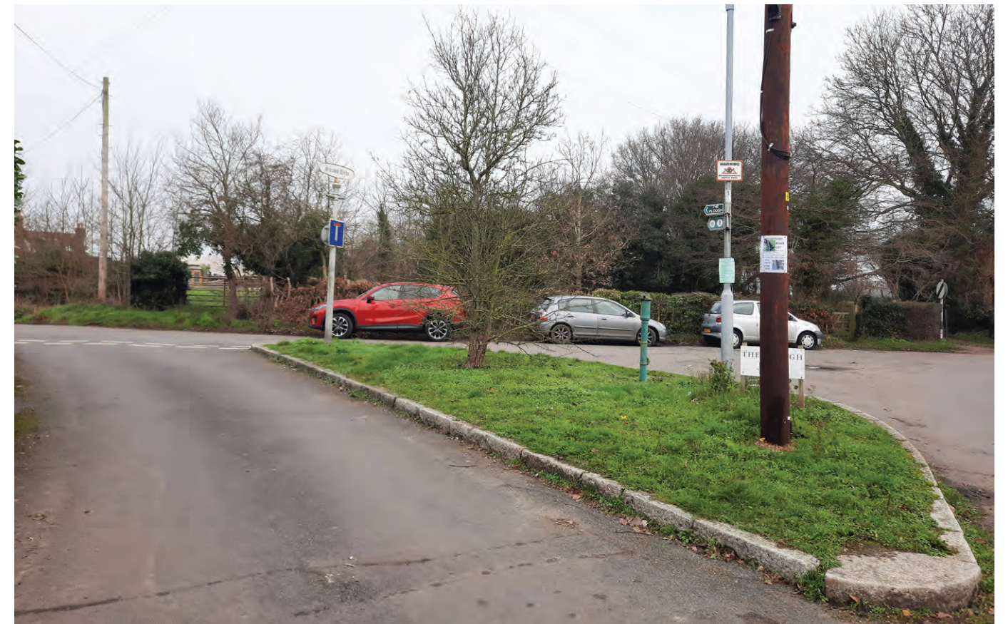
The central green retains some historic street furniture. Unfortunately the fluted column to the former C19 light post has been used for attaching other signs at a high level which detracts from its appearance.