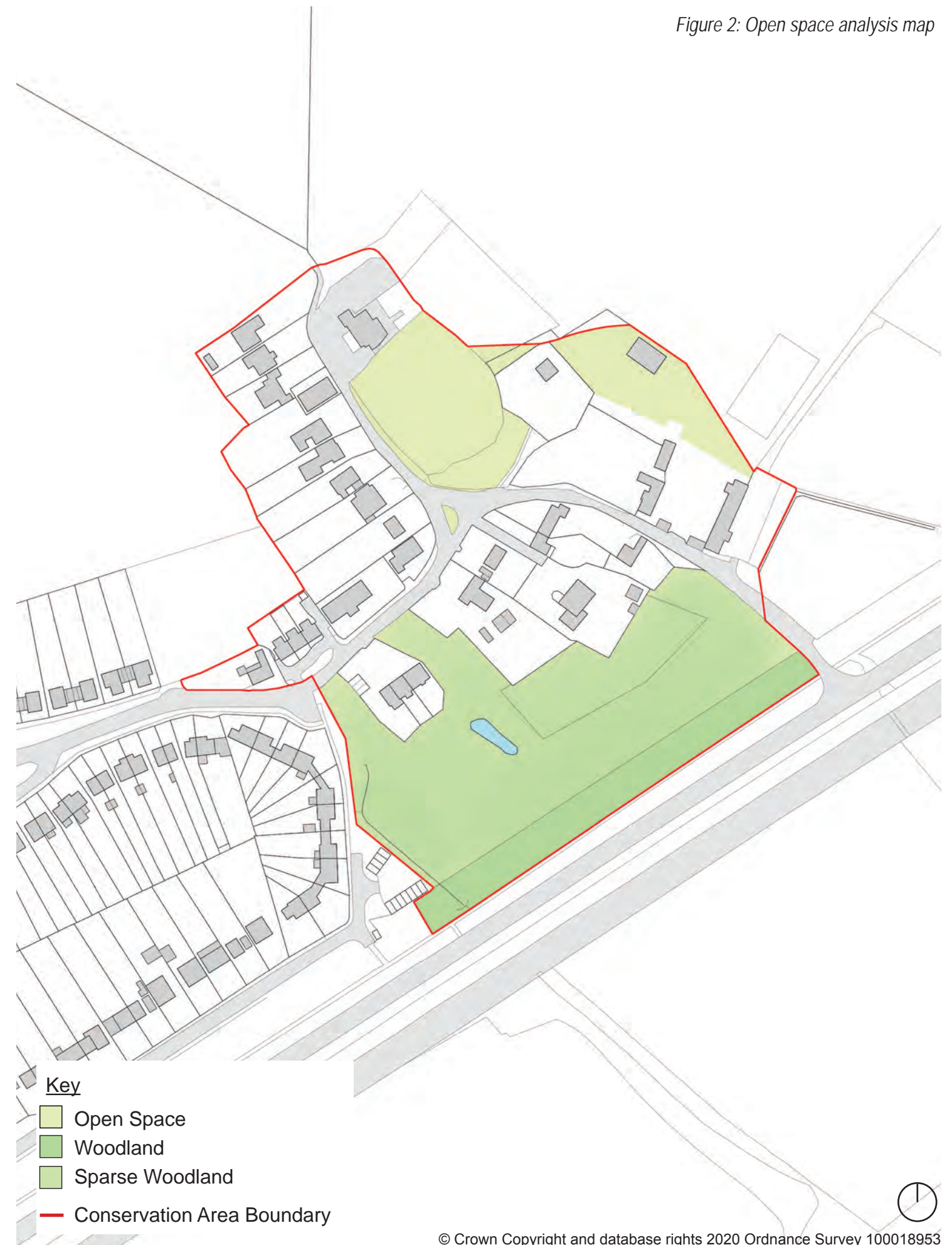
Figure 2: Open space analysis map