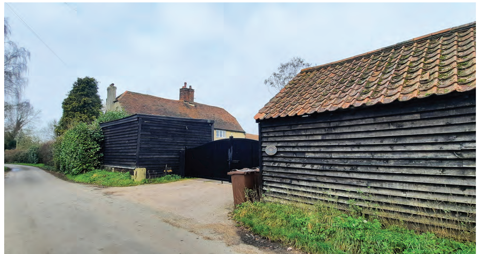
Sleapshyde Farm is a historic farmstead dating to the 1500s and the clay tiles and weatherboarding unify these buildings. Sleapshyde Farmhouse is one of the most prominent buildings.