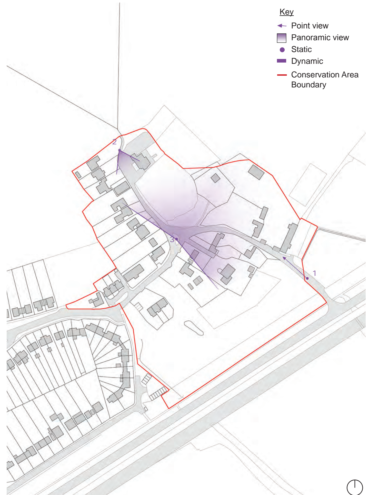
Figure 3: Significant views map

This is the first view of the conservation area when entering from the south. Sleapshyde Farm comes into view between the high hedgerows. The Farmhouse was one of the higher status buildings in the area. Most of the buildings pre-date the 19C and the view has changed little in the past couple of centuries.