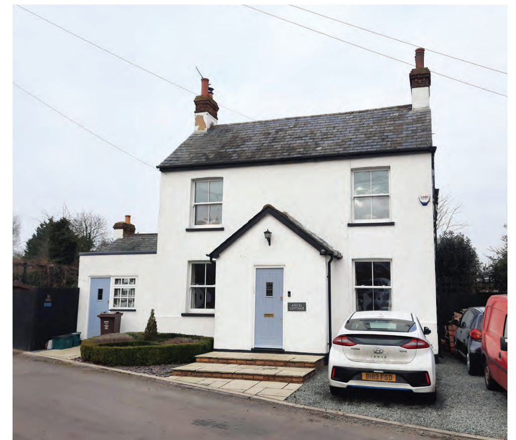
Angel Cottage's form and proximity to the street is reflective of its former use as a beer house.

6.3 All trees within a Conservation Area above a certain size have automatic protection, whether or not they are covered by a TPO, and permission must be sought from the Trees and Woodlands section of St Albans City and District Council before the lopping, topping, pruning or felling of any trees other than fruit trees.