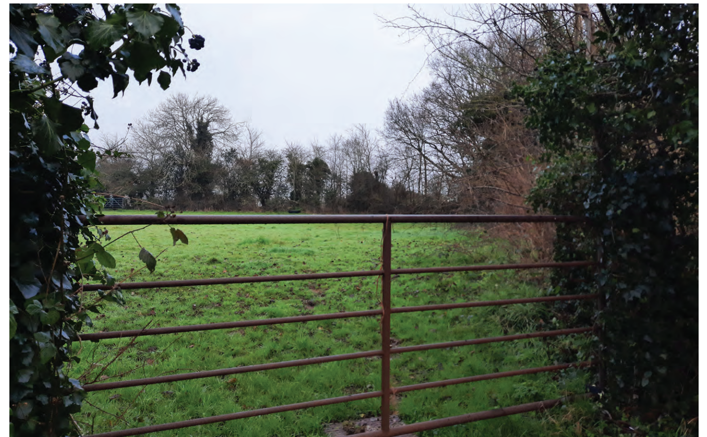
The paddock runs adjacent to the north lane and provides greenery in the centre of the conservation area and was historically known as the collect