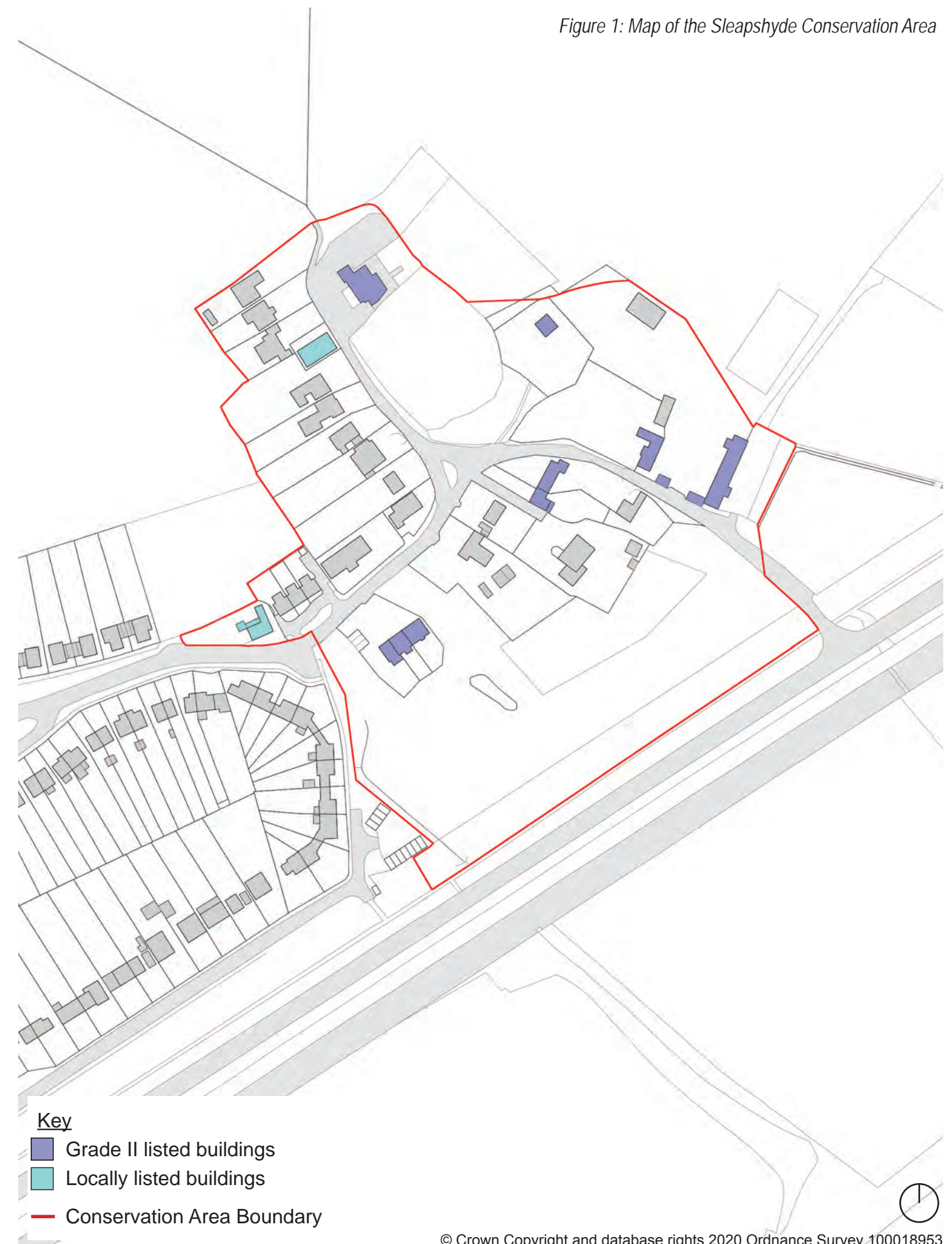
Figure 1: Map of the Sleafshyde Conservation Area