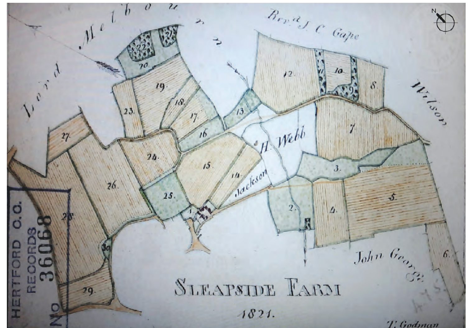
The 1821 map of Sleafshyde, by T. Godman shows Sleafshyde Farm, and the surrounding buildings, including the Plough, Farm Cottage and some other buildings. Courtesy of HALS, 36068)

4.6 During the C20 some of the old farmers' cottages were demolished and mostly replaced with bungalows. A number small of dwellings were built in the early part of the century from temporary materials and there has been some limited in filling in the hamlet centre.