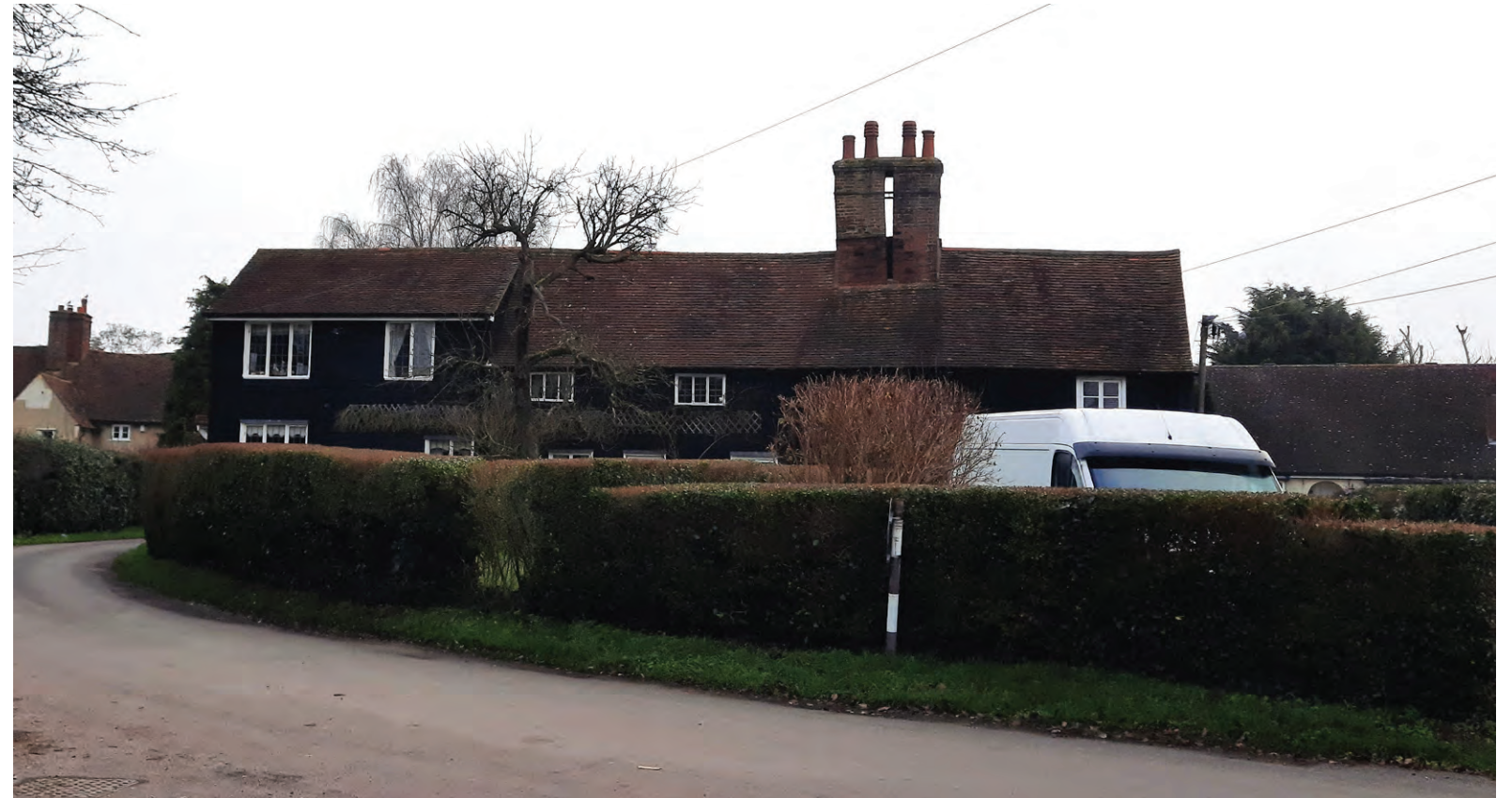
Although a little too tall, the 1980s side extension to Rose Cottage relates well to the original building by using similar weatherboarding and clay roof tiles.

5.12 Rose cottage and Little Rose Cottage sits opposite Sleapshyde Farm and comprise of one long range, a pair C17 cottages. The building has a typical vernacular appearance with weatherboard, small features and a clay plain tile roof. Despite being set back and at an angle to the central green, Rose cottage is the most prominent building in the centre of the hamlet. This is due, in part to its dominant central chimney stack of two tall square shafts.