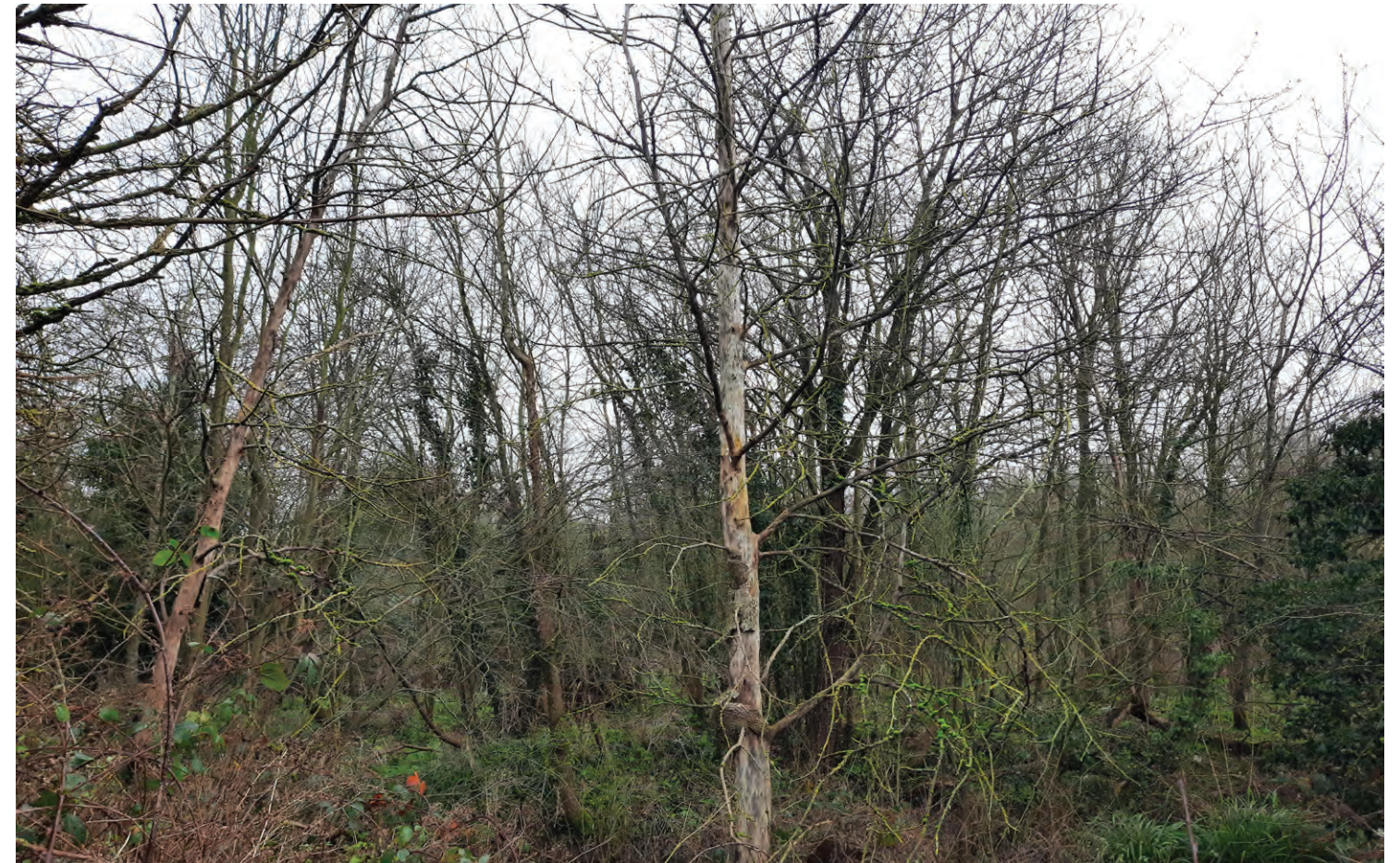
The area of woodland to the south-east of the conservation area reduces the noise impact and invisibility of the North Orbital on the Conservation Area