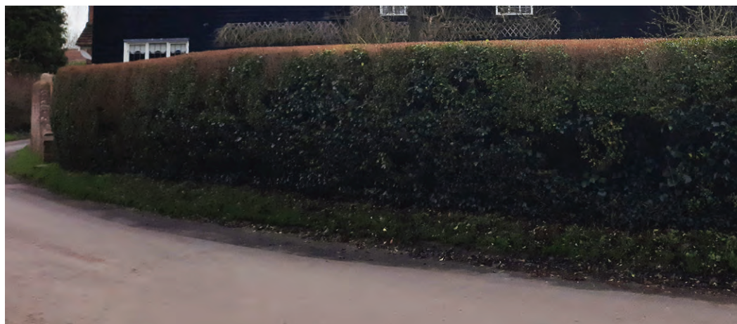
Typical hedgerow and un-kerbed road in Sleepshyde

9.1 It is the Council's aim to encourage retention of those features which make the Conservation Area special – not just historic buildings and their architectural features, but their settings and boundary features – historic walls, fencing, and hedges. Every effort should be made to maintain important landscape features and the existing balance of buildings and landscape