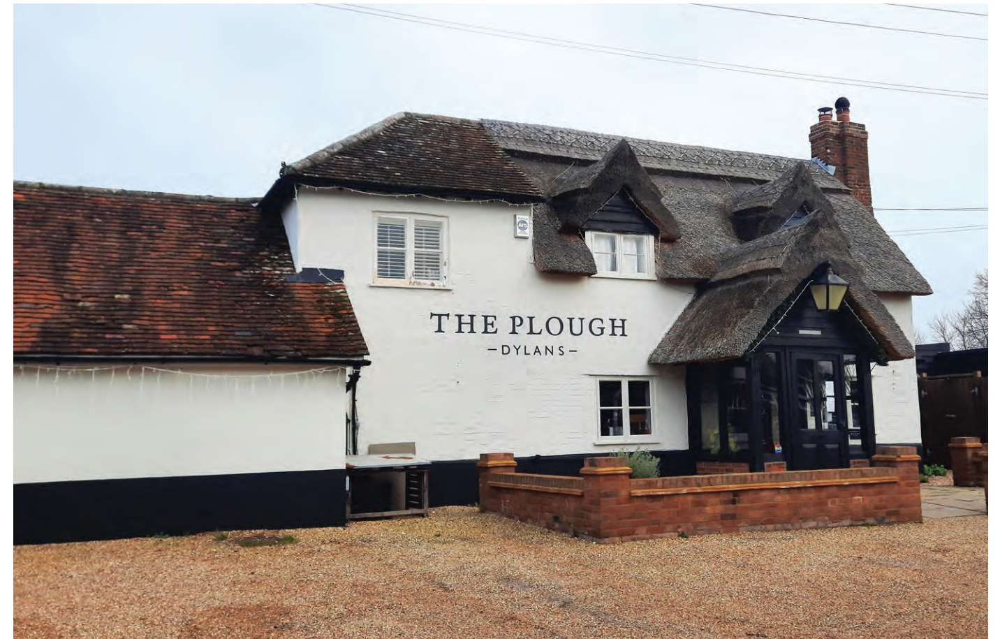
The Plough is a prominent building due to its thatched roof and more isolated location as the only building on the east side of the northern lane.

5.6 The Plough is visible from the paddock and the pond to the west of the central green which gives the public house an open setting. The publican used to farm the adjacent field until the C19 and this strengthens the association between the public house and the adjacent land. The paddock and pond are surrounded by hedging and trees including the road frontage. These open spaces are important elements which contribute to the rural character of the hamlet.