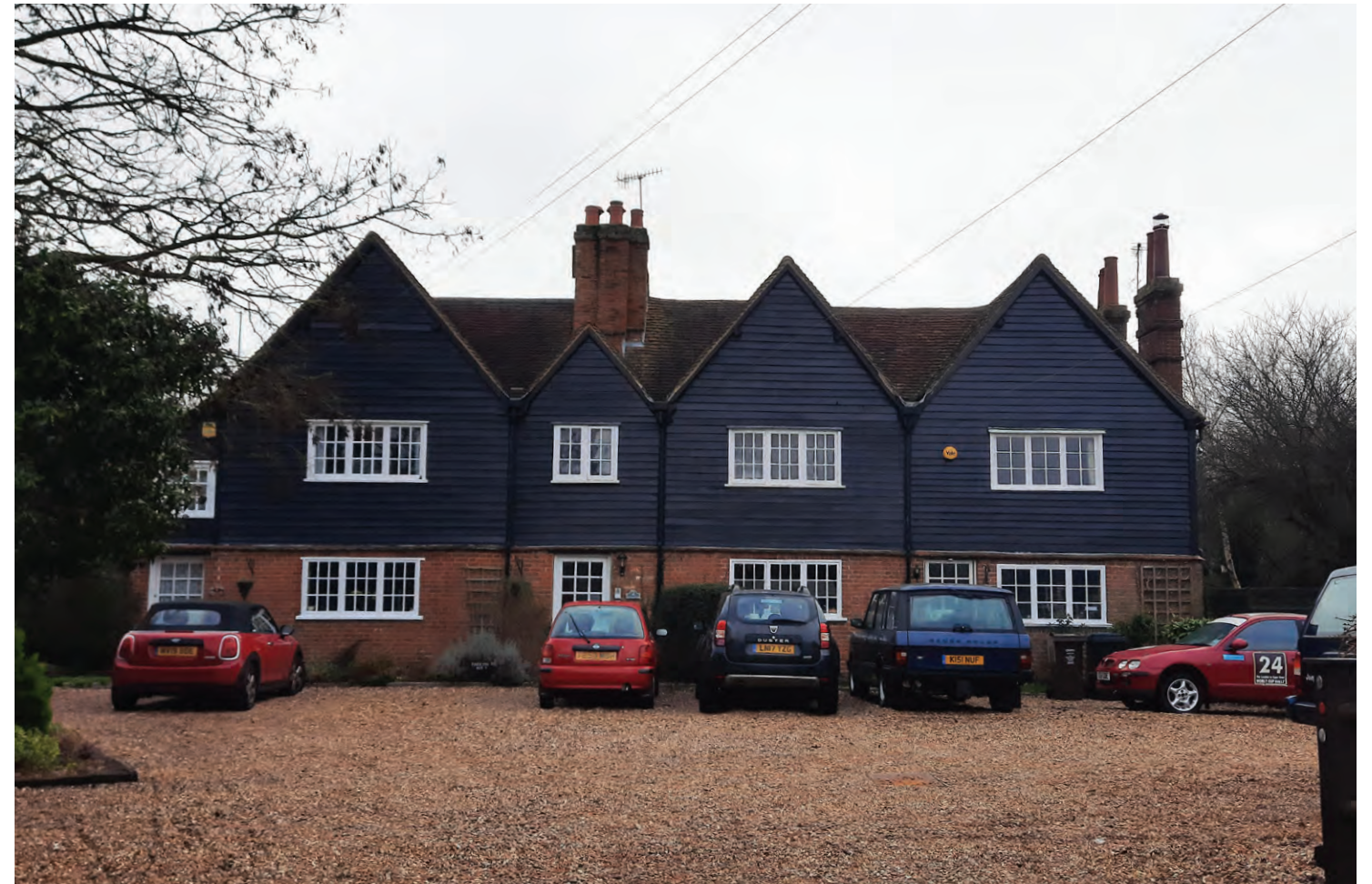
Ye Olde House has a striking row of gable ends which mark the start of the historic hamlet.

5.16 Most of the other buildings in the conservation area are interwar and later in date. This development is no particular architectural or historic interest. The housing is generally considered to have a neutral impact because for the most part they are reticent as they are set quite low, only 1-1.5 storeys in height. The low height of the new development allows the more historic and architecturally interesting buildings to be more prominent.