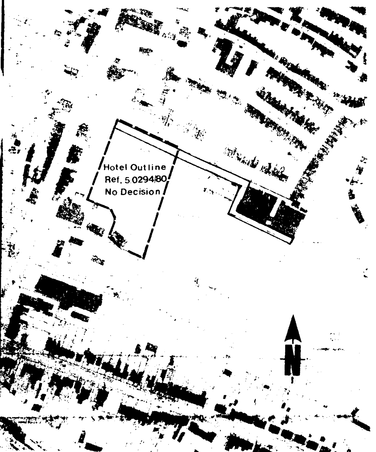
Location Site O.S.TL 1406 Scale 1:2500